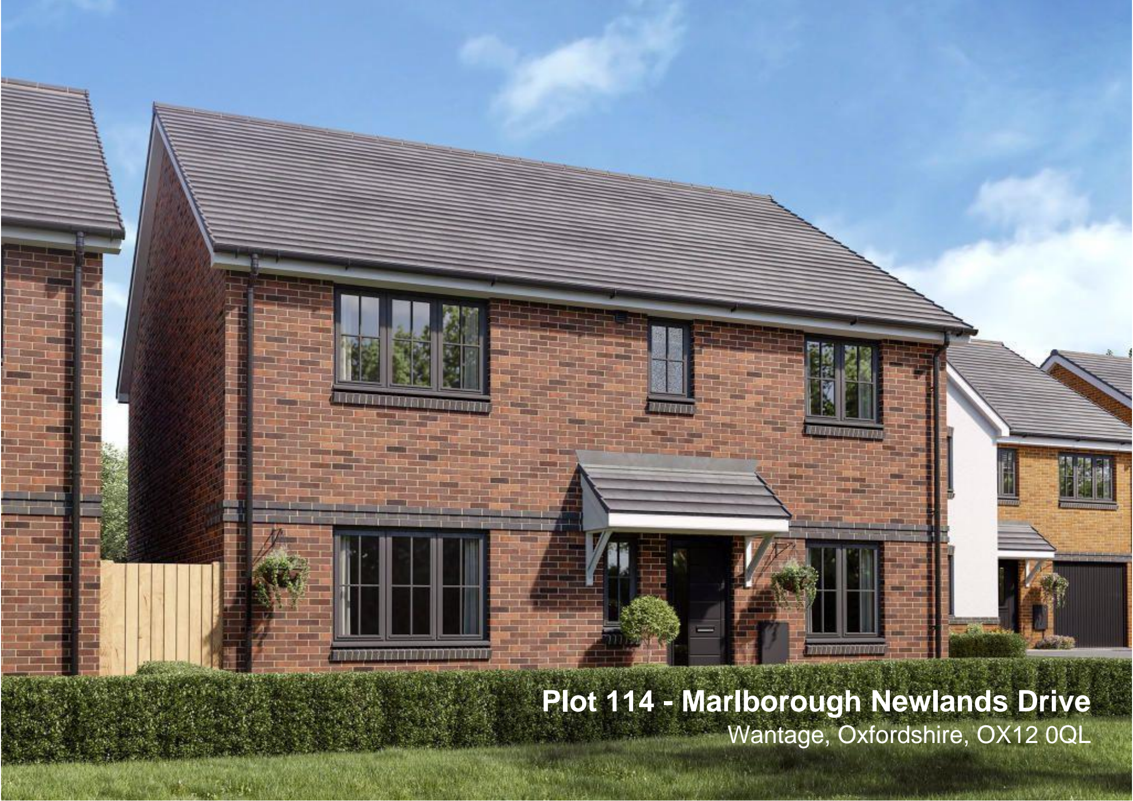
Plot 114 - Marlborough Newlands Drive Wantage, Oxfordshire, OX12 0QL