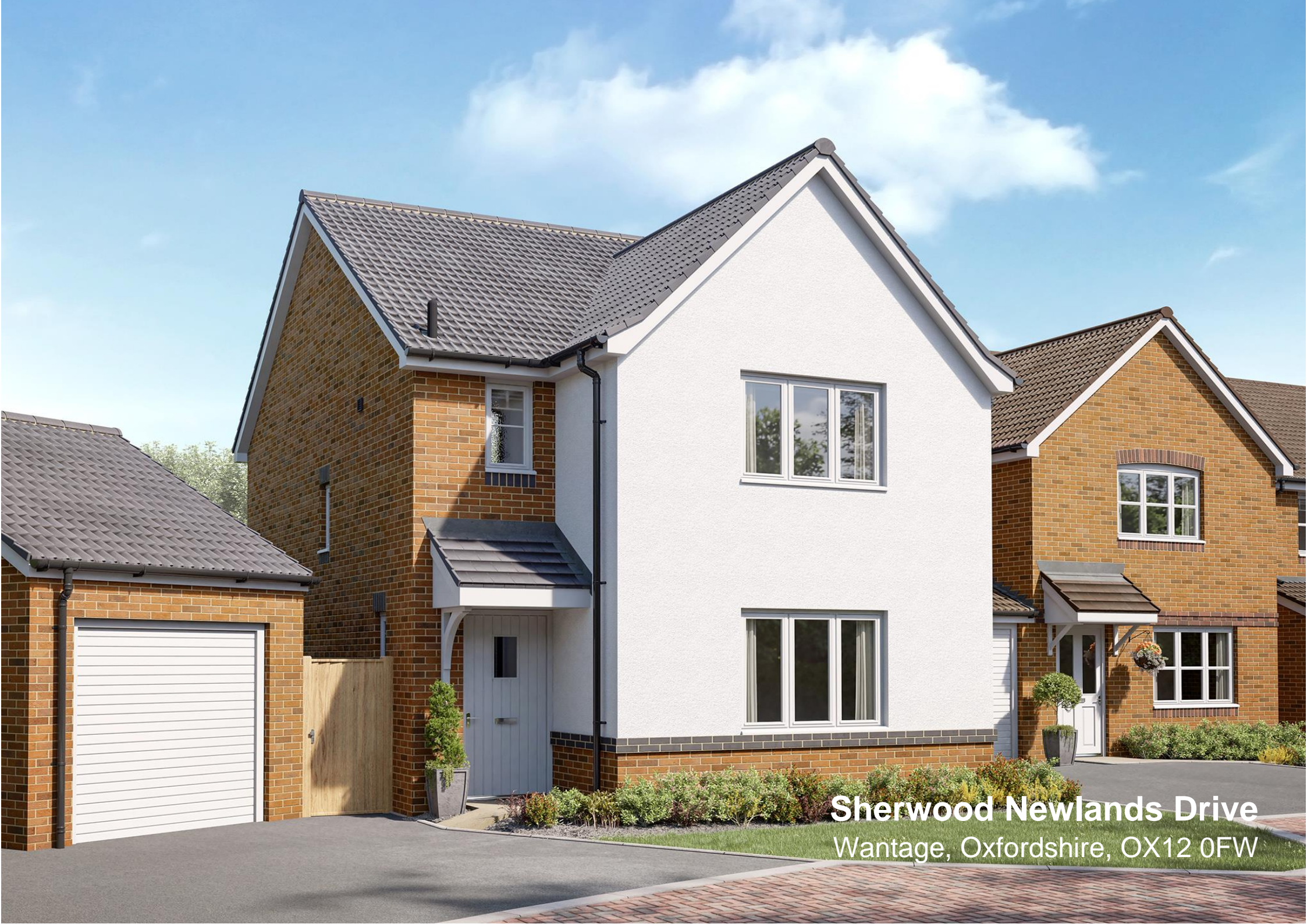
Sherwood Newlands Drive Wantage, Oxfordshire, OX12 0FW