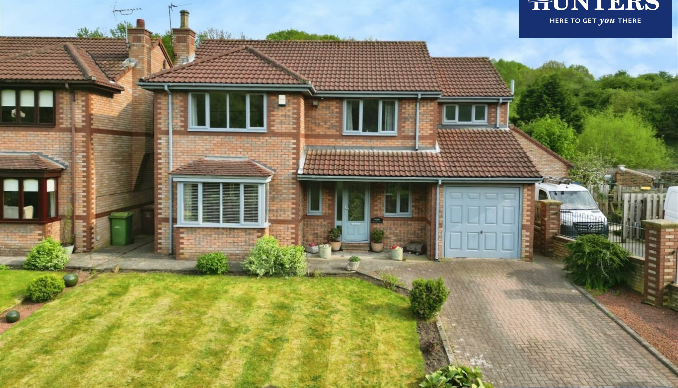
River View, Alice Well Villas, Cox Green, Washington, Sunderland, SR4 9JU