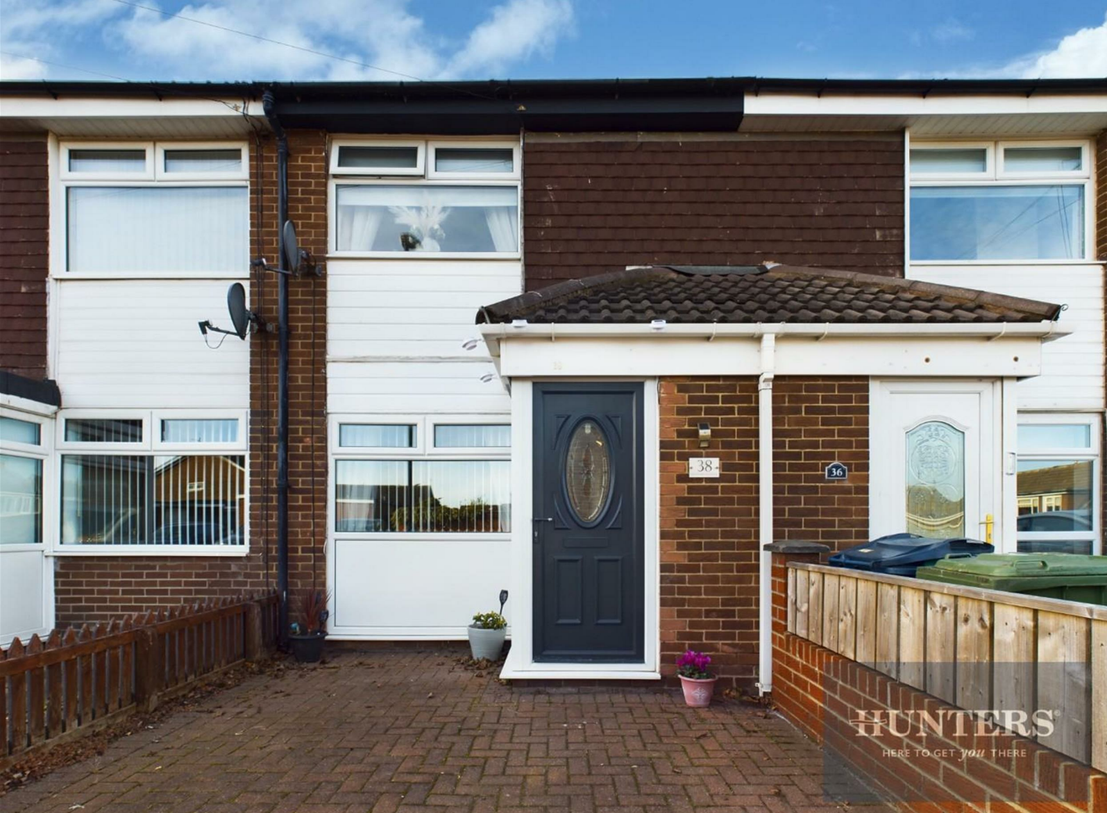
Edgeworth Crescent, Sunderland