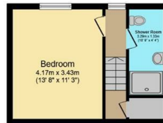
Second Floor Floor area 24.2 sq.m. (260 sq.ft.)