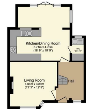
Ground Floor Floor area 49.1 sq.m. (529 sq.ft.)