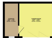
Garden Room Floor area 15.2 sq.m. (163 sq.ft.)

Total floor area: 114.5 sq.m. (1,232 sq.ft.)