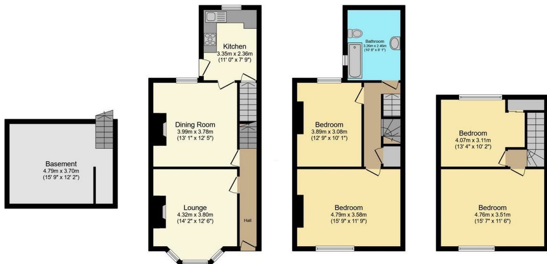
Basement Floor area 17.7 m 2 (191 sq.ft.)