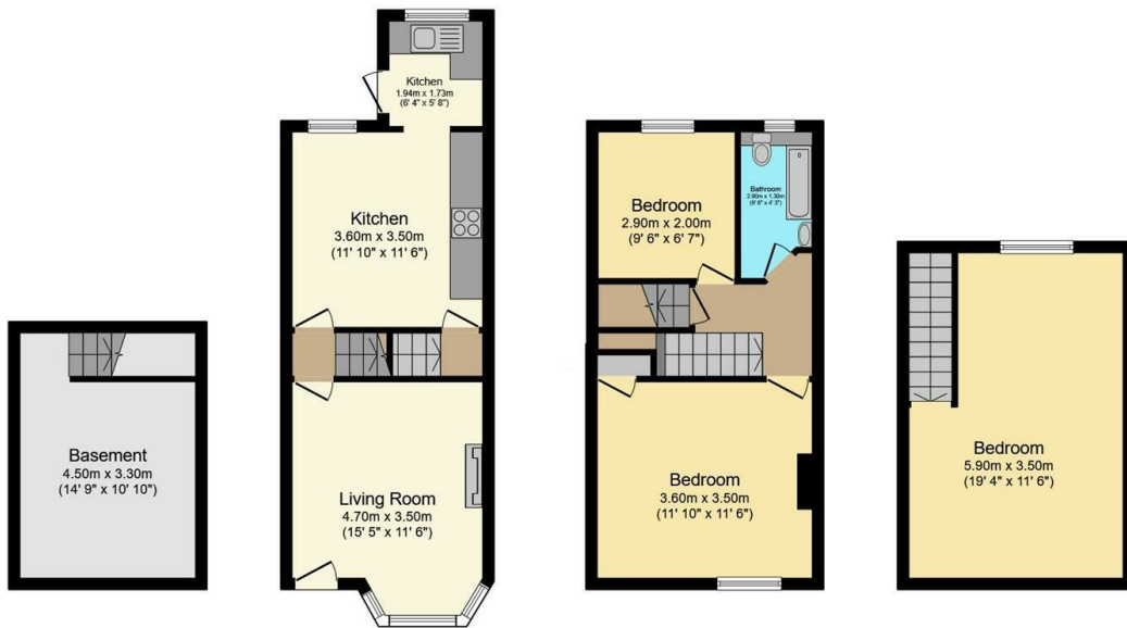
Basement Floor area 14.6 m 2 (158 sq.ft.)