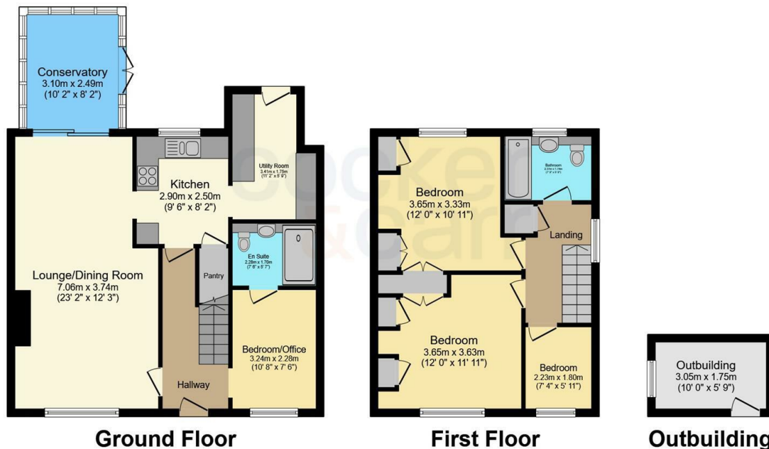
Total floor area 118.9 m 2 (1,280 sq.ft.) approx This plan is for illustration purposes only and may not be representative of the property. Plan not to scale. Powered by PropertyBox