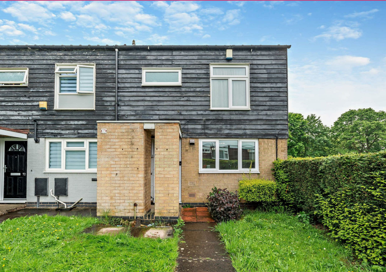
71 Cambrian, Tamworth, B77 2EF Offers in excess of £170,000