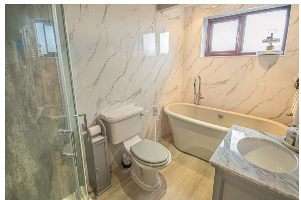
Windsor Drive Liversedge