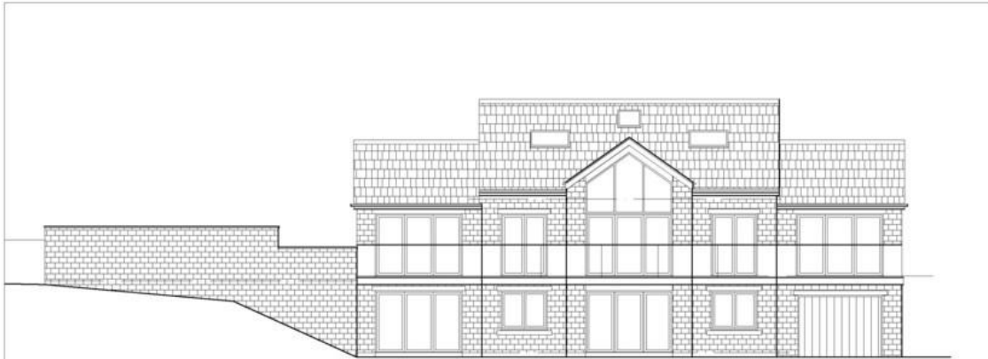
Plot 2 South Elevation