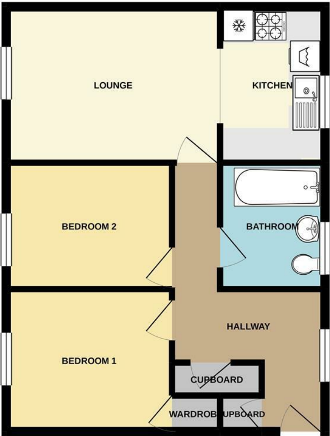
GROUND FLOOR 526 sq.ft. (48.9 sq.m.) approx.