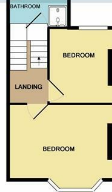
1ST FLOOR APPROX. FLOOR AREA 398 SQ.FT. (37.0 SQ.M.)

TOTAL APPROX. FLOOR AREA 872 SQ.FT. (81.0 SQ.M.)