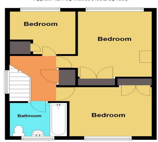
Total area: approx. 83.7 sq. metres (901.1 sq. feet) 45 Afon Close