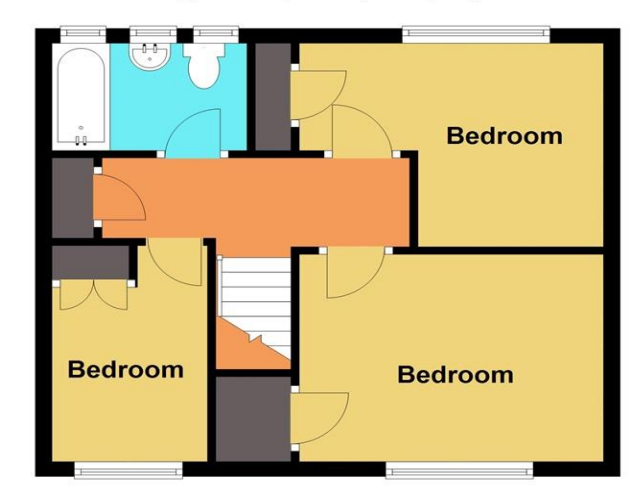
Total area: approx. 75.6 sq. metres (813.7 sq. feet) 19 Green Court

Approx. 38.7 sq. metres (416.7 sq. feet)