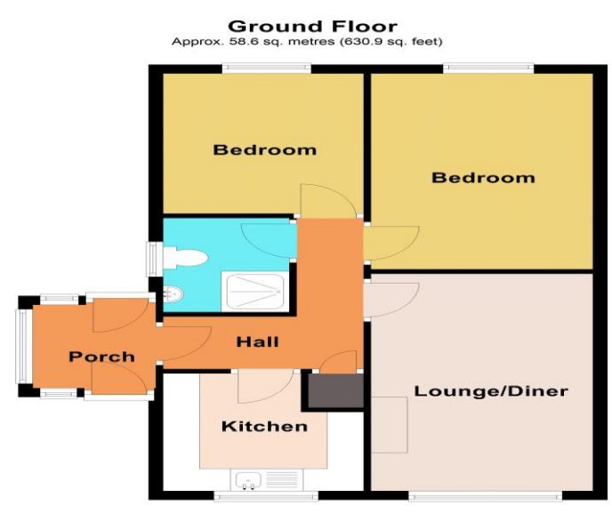
Total area: approx. 58.6 sq. metres (630.9 sq. feet)

he Partner Agent and Auctioneer may recommend the services of third parties to you. Whilst these services are recommended as it is believed they will be of benefit; you are under no obligation to use any of these services and you should always consider your options before services are accepted. Where services are accepted the Auctioneer or Partner Agent may receive payment for the recommendation