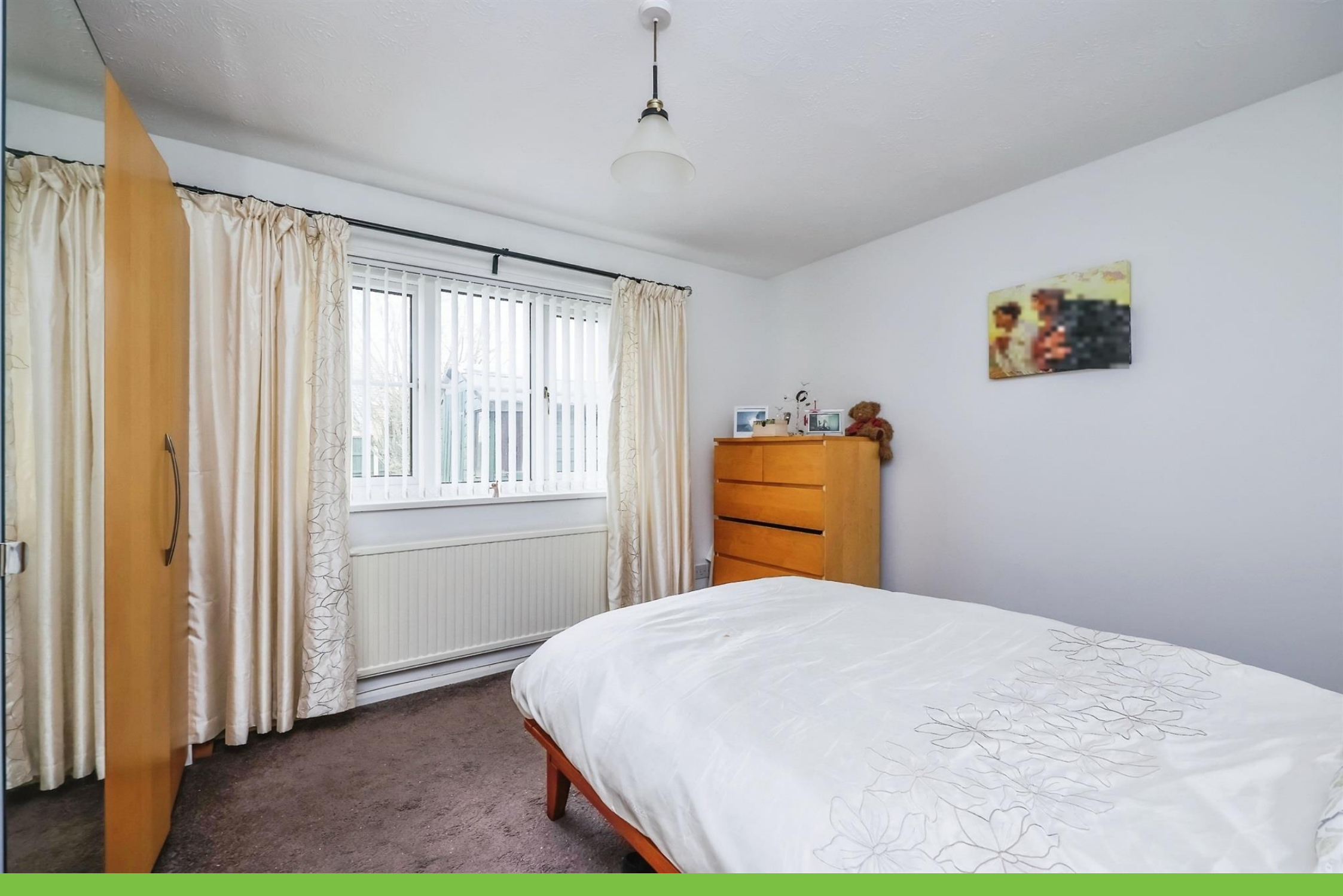
Residential Sales & Lettings | Mortgage Services | Conveyancing | Surveyors | Land & New Homes