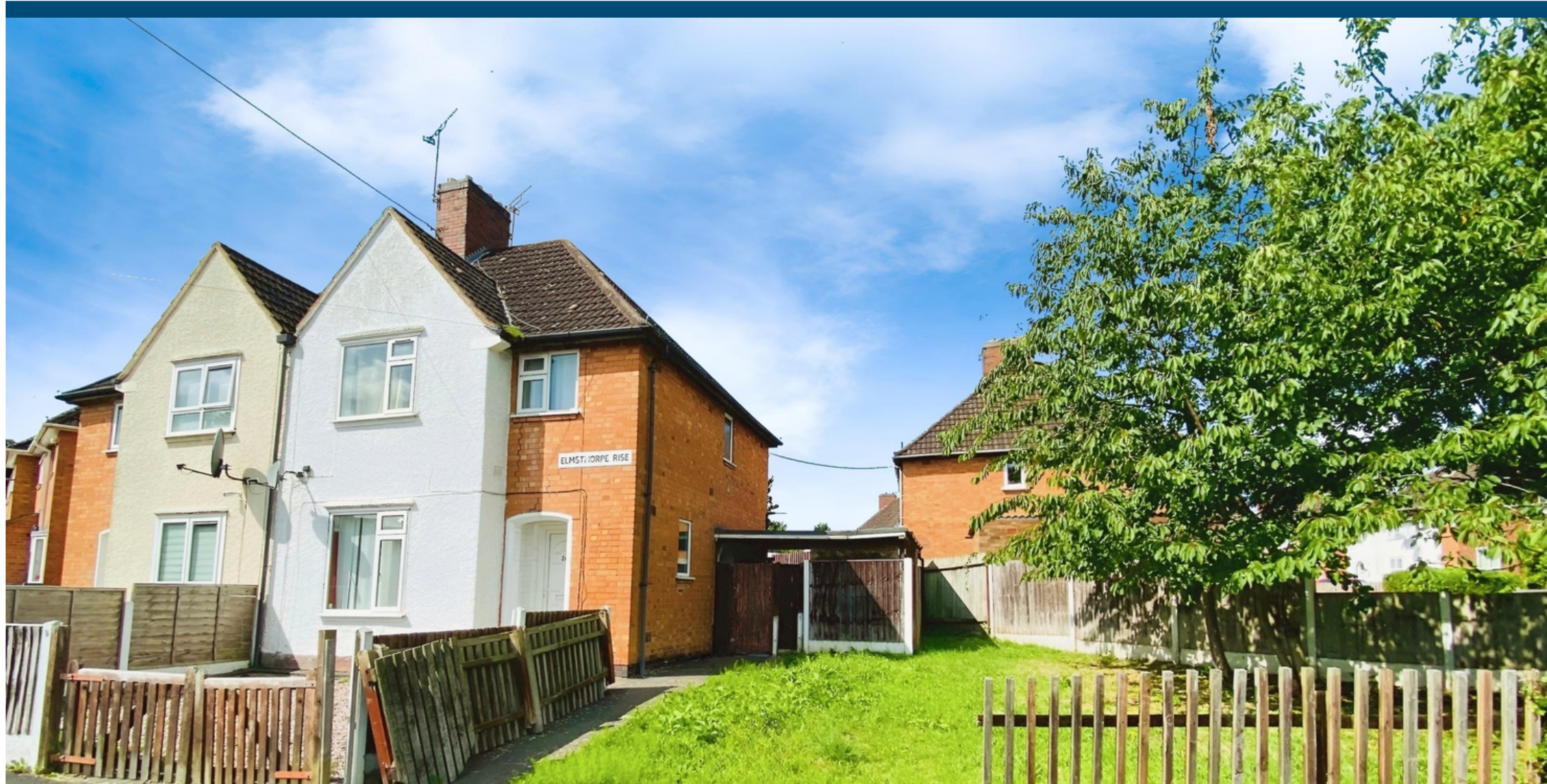
Elmsthorpe Rise, Braunstone, LE3