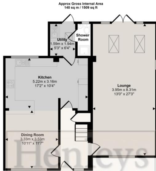
Ground Floor Approx 77 sq m / 826 sq ft