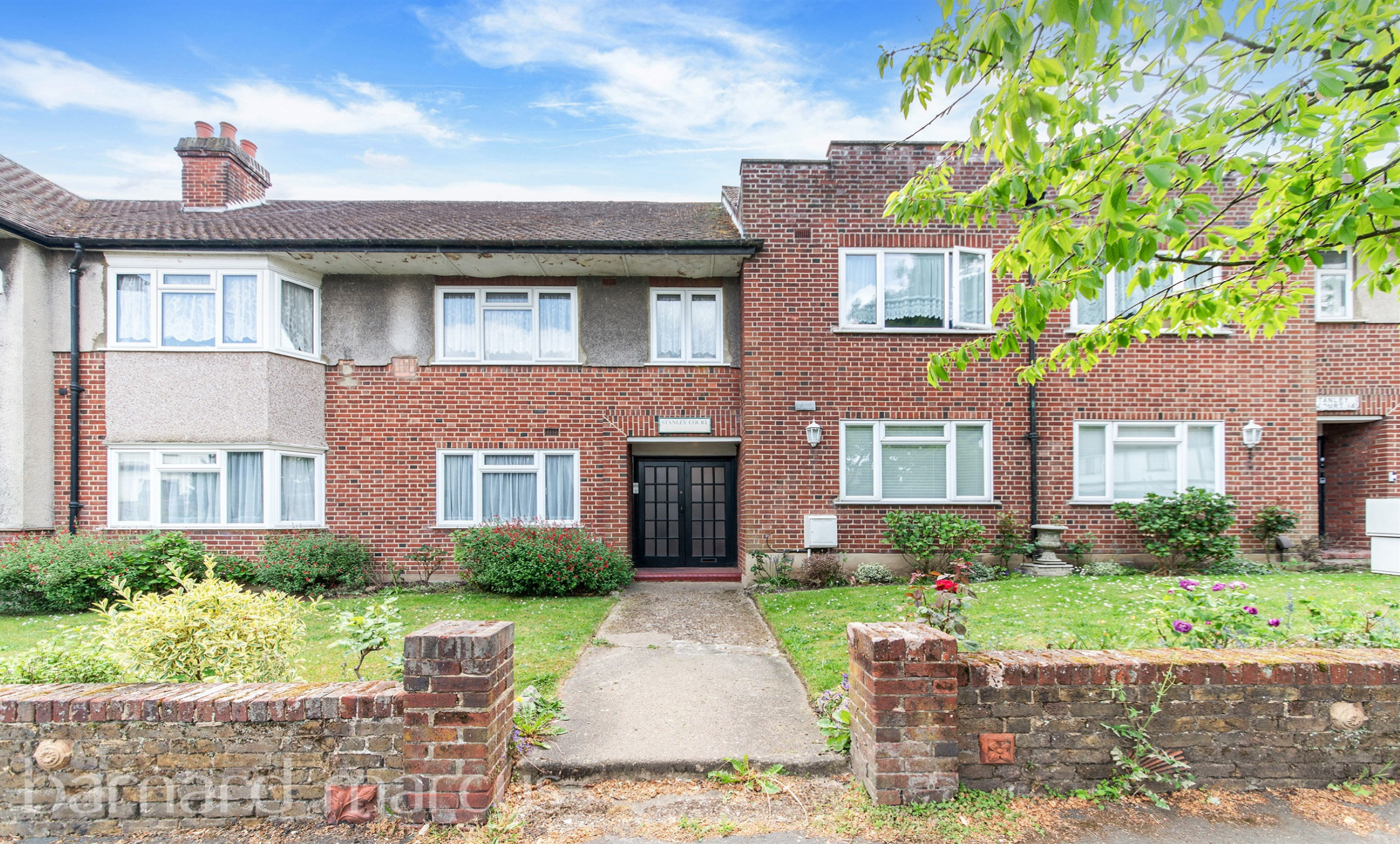
Stanley Court Stanley Park Road, Carshalton SM5 3JF

Not for marketing purposes INTERNAL USE ONLY