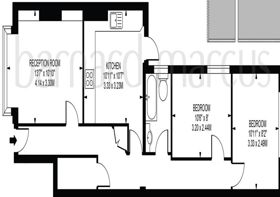
GROUND FLOOR FOR ILLUSTRATION PURPOSES ONLY

THIS FLOOR PLAN SHOULD BE USED AS A GENERAL OUTLINE FOR GUIDANCE ONLY AND DOES NOT CONSTITUTE IN WHOLE OR IN PART AN OFFER OR CONTRACT. ANY INTENDING PURCHASER OR LESSEE SHOULD SATISFY THEMSELVES BY INSPECTION, SEARCHES, ENQUIRIES AND FULL SURVEY AS TO THE CORRECTNESS OF EACH STATEMENT. ANY AREAS, MEASUREMENTS OR DISTANCES QUOTED ARE APPROXIMATE AND SHOULD NOT BE USED TO VALUE A PROPERTY OR BE THE BASIS OF ANY SALE OR LET.