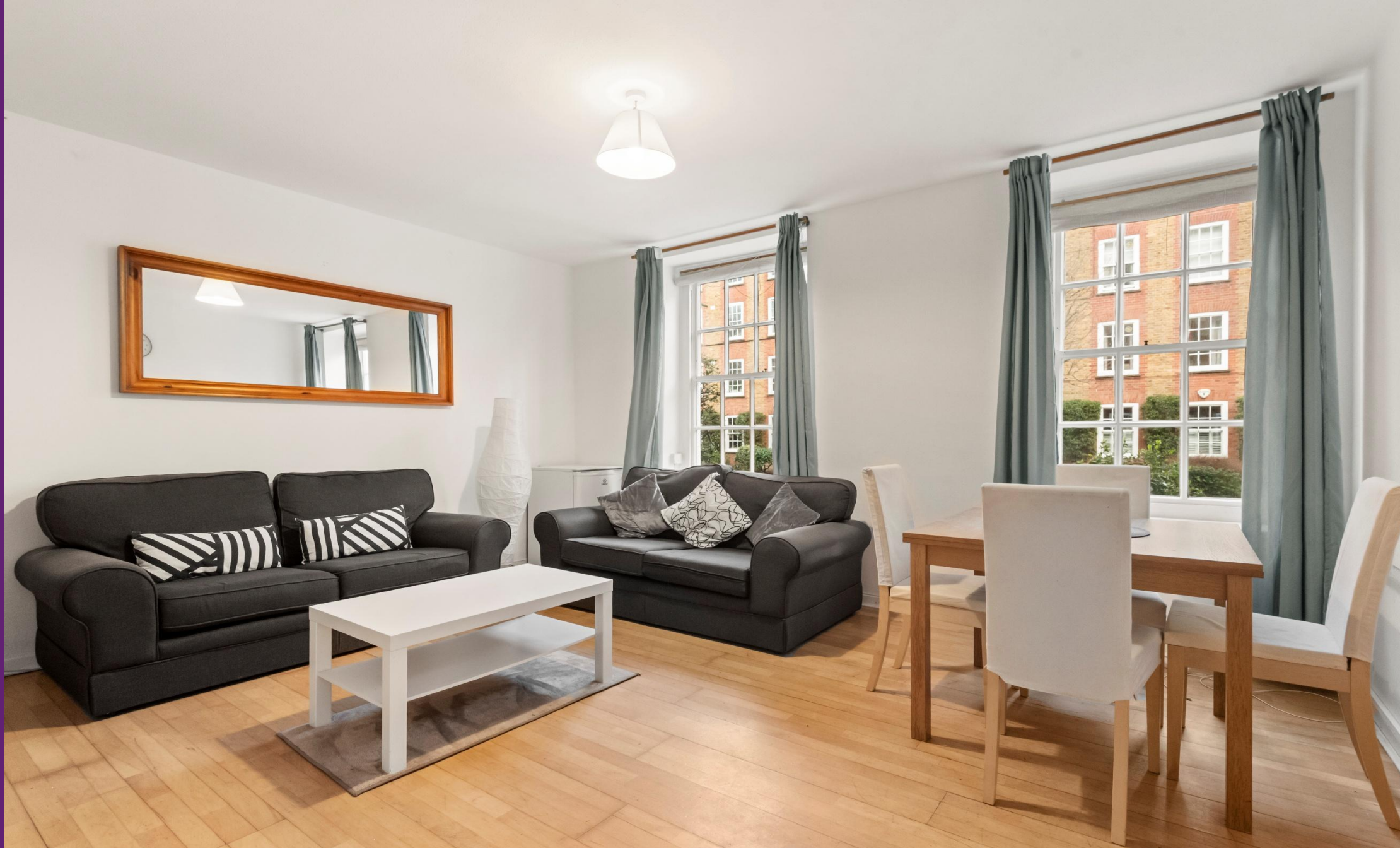
White House Vicarage Crescent, SW11