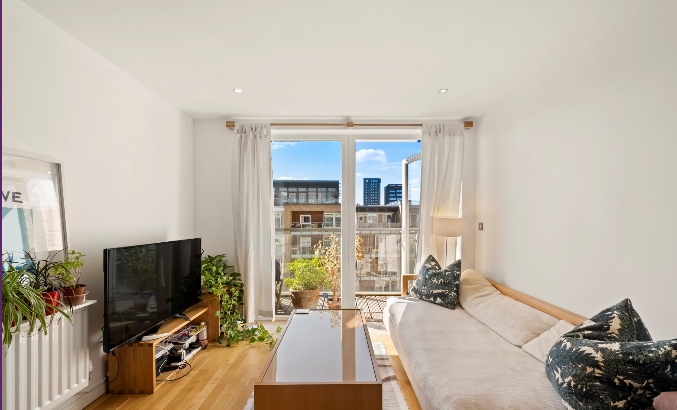
Viridian Apartments 75 Battersea Park Road, SW8