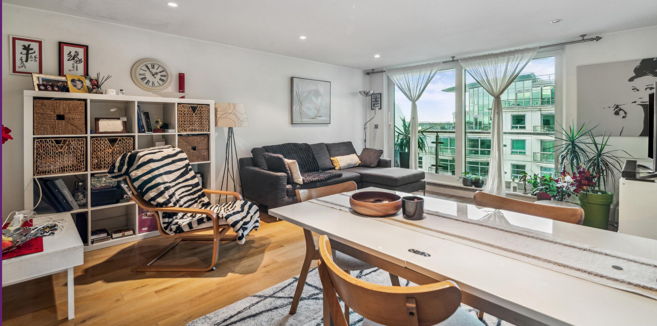
Hamilton House St George Wharf, SW8