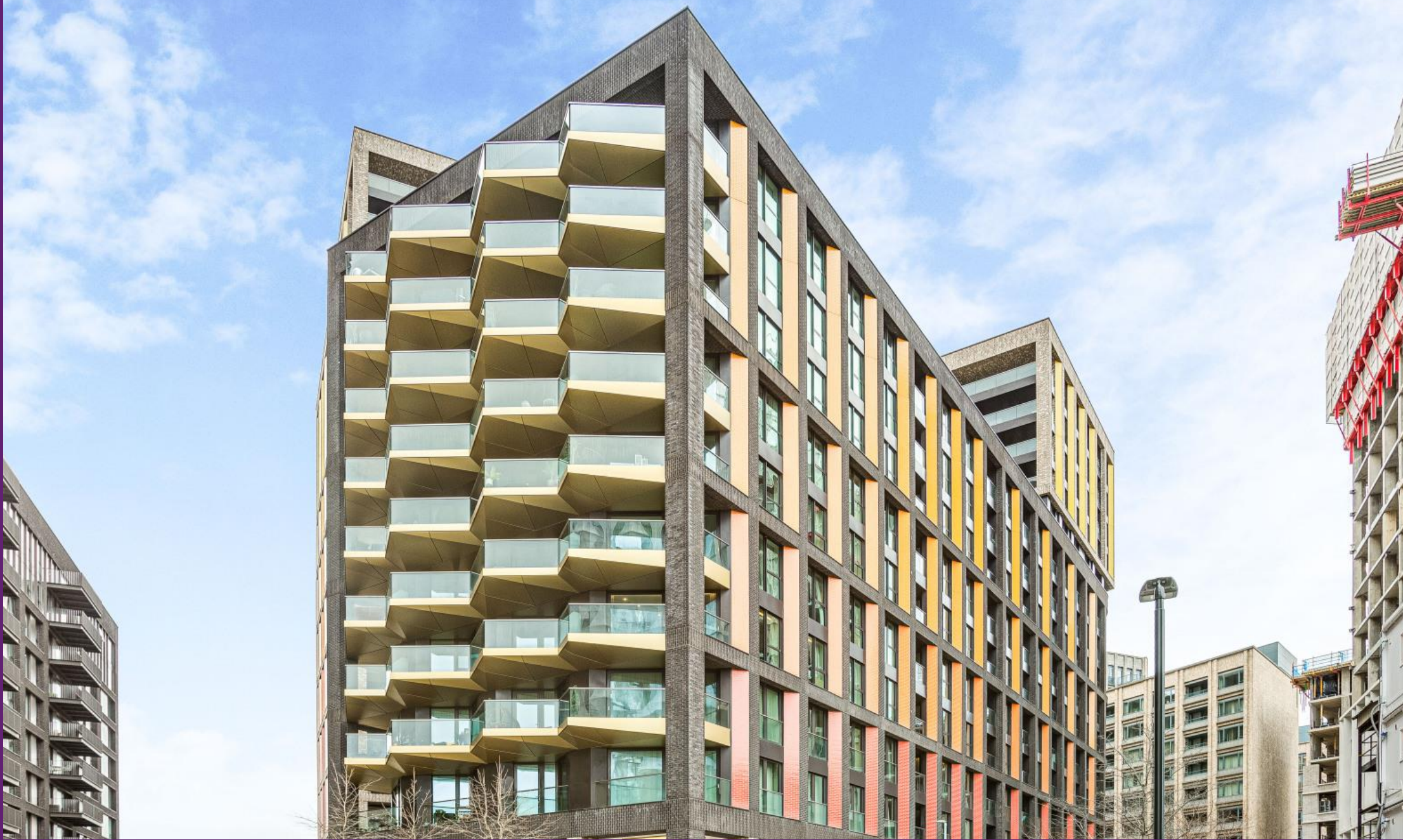
Madeira Tower 30 Ponton Road, SW11