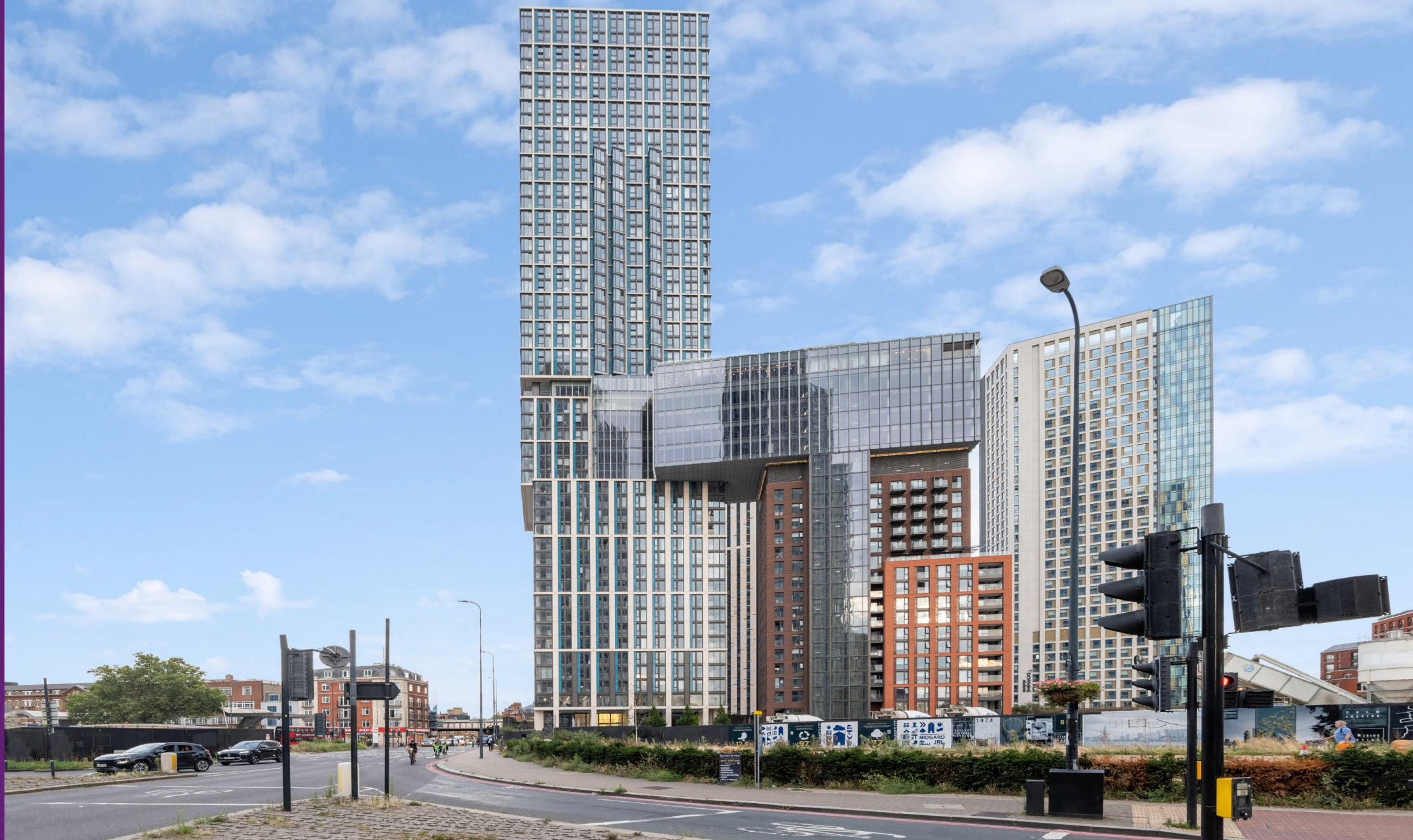
Damac Tower 67 Bondway, SW8