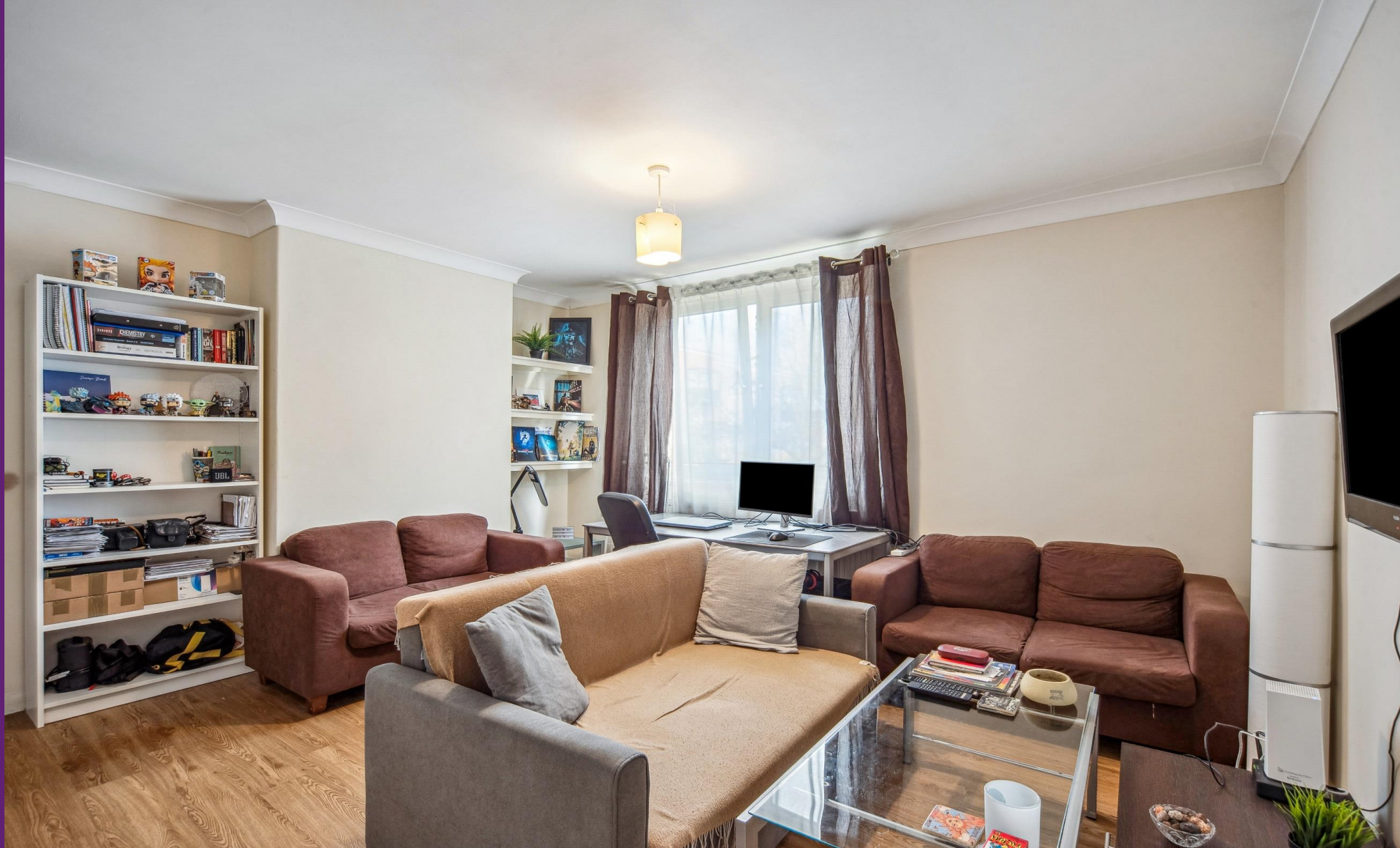
Ramsey House Maysoule Road, SW11