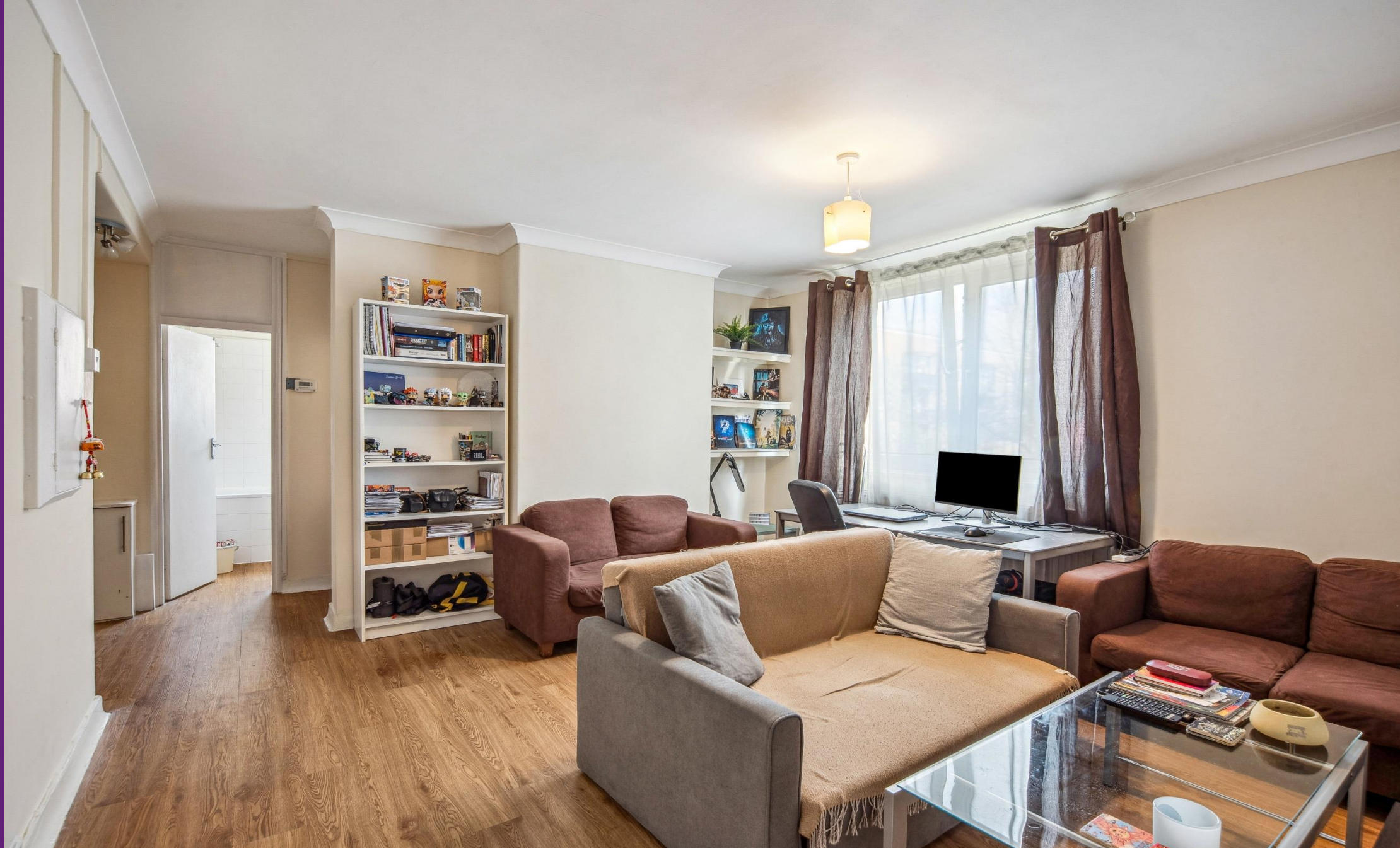
Ramsey House Maysoule Road, SW11