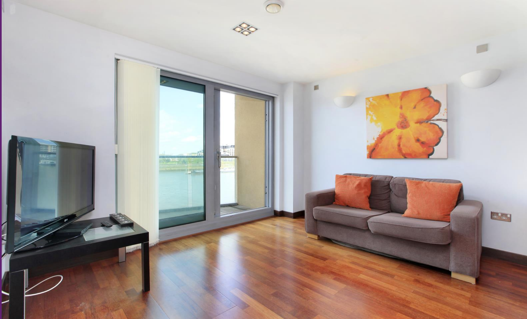
Vicentia Court Bridges Court Road, SW11