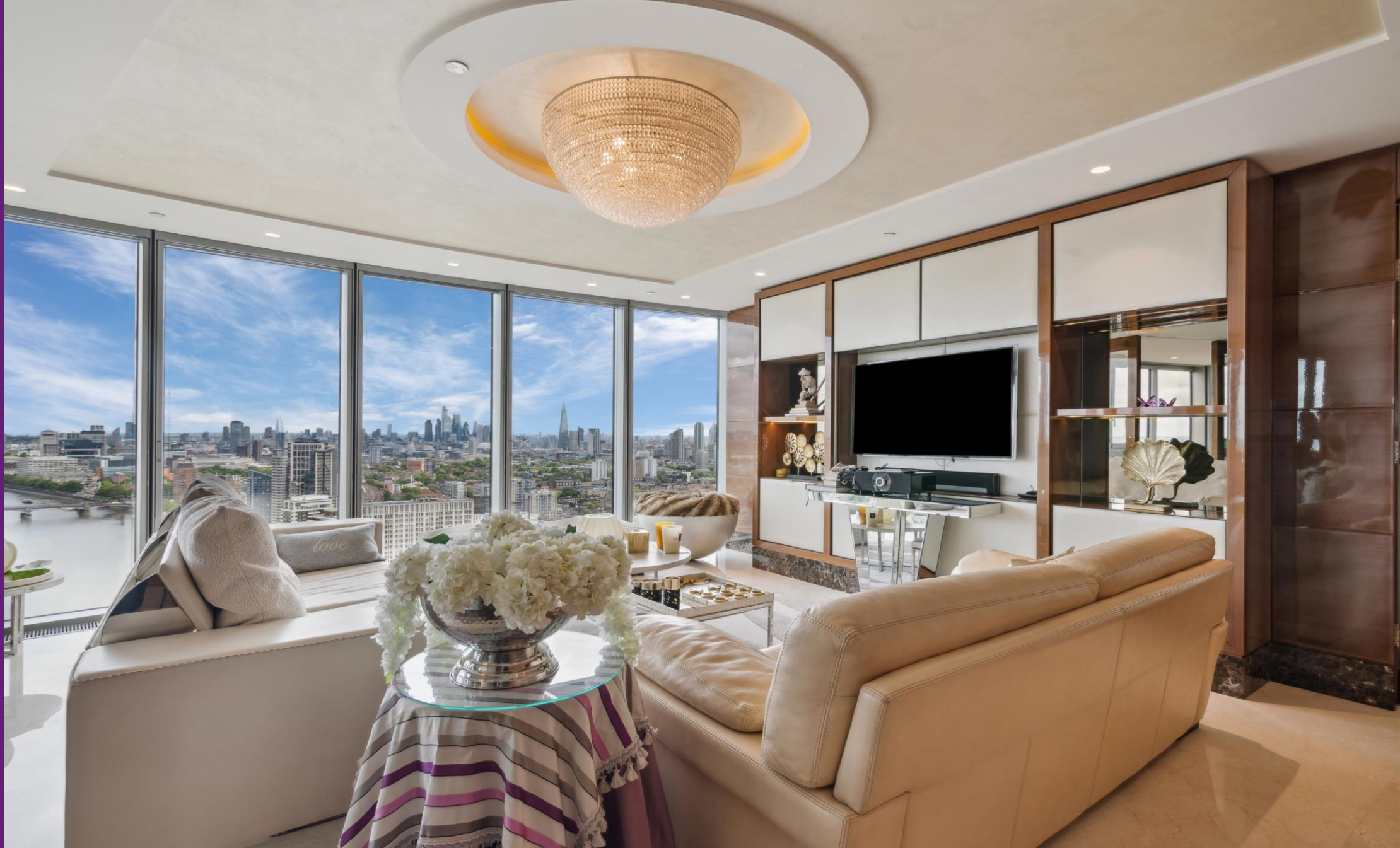
The Tower 1 St. George Wharf, SW8