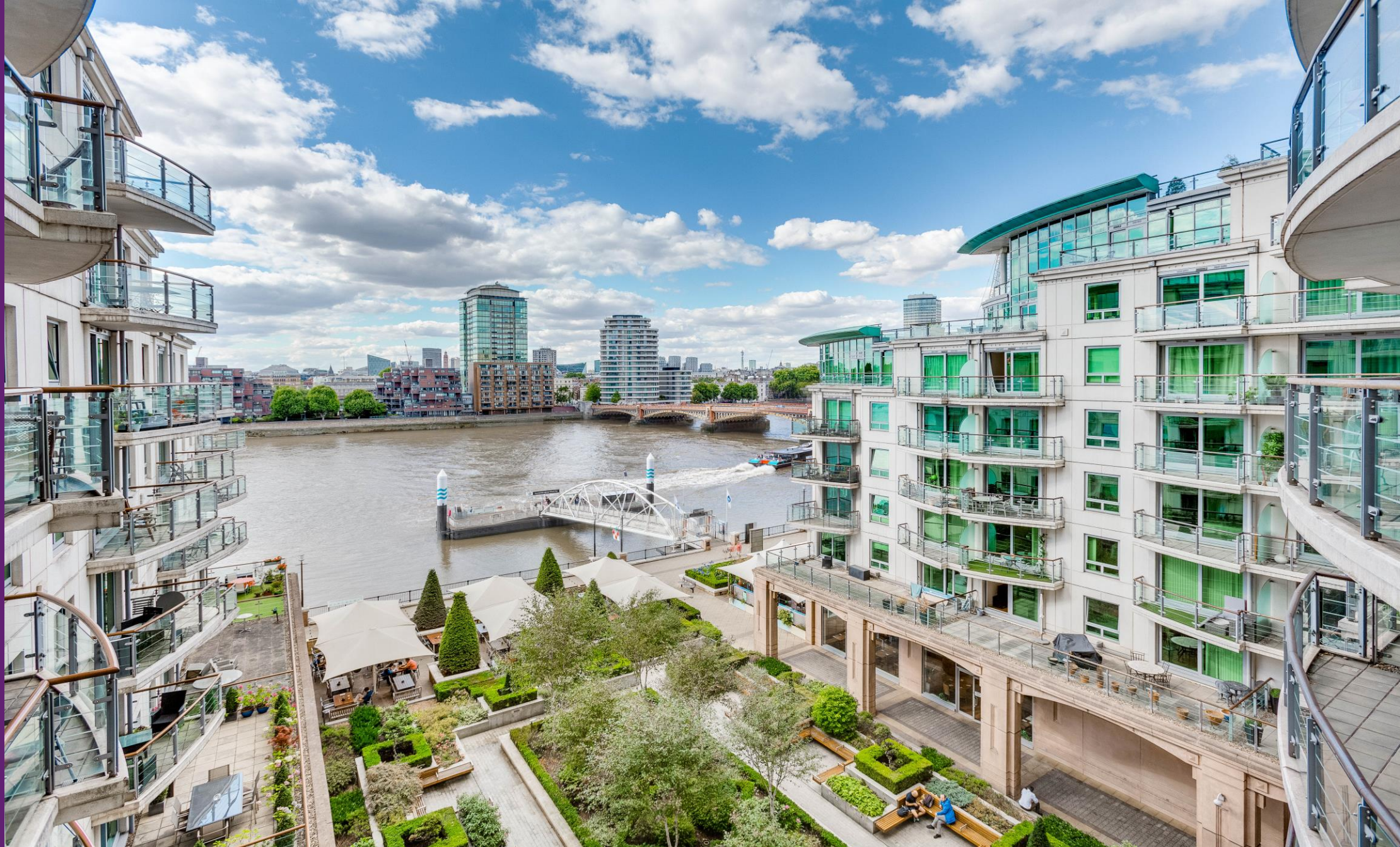
Hamilton House 6 St. George Wharf, SW8