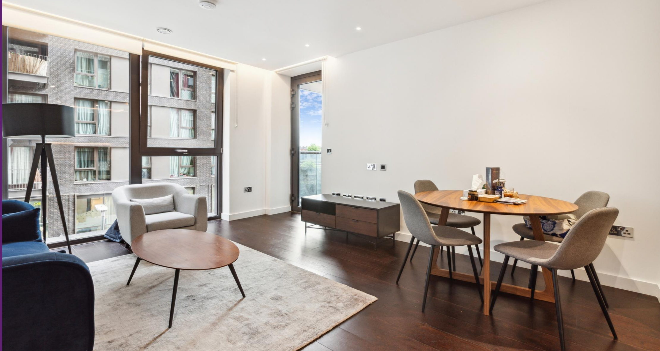
Madeira Tower 30 Ponton Road, SW11