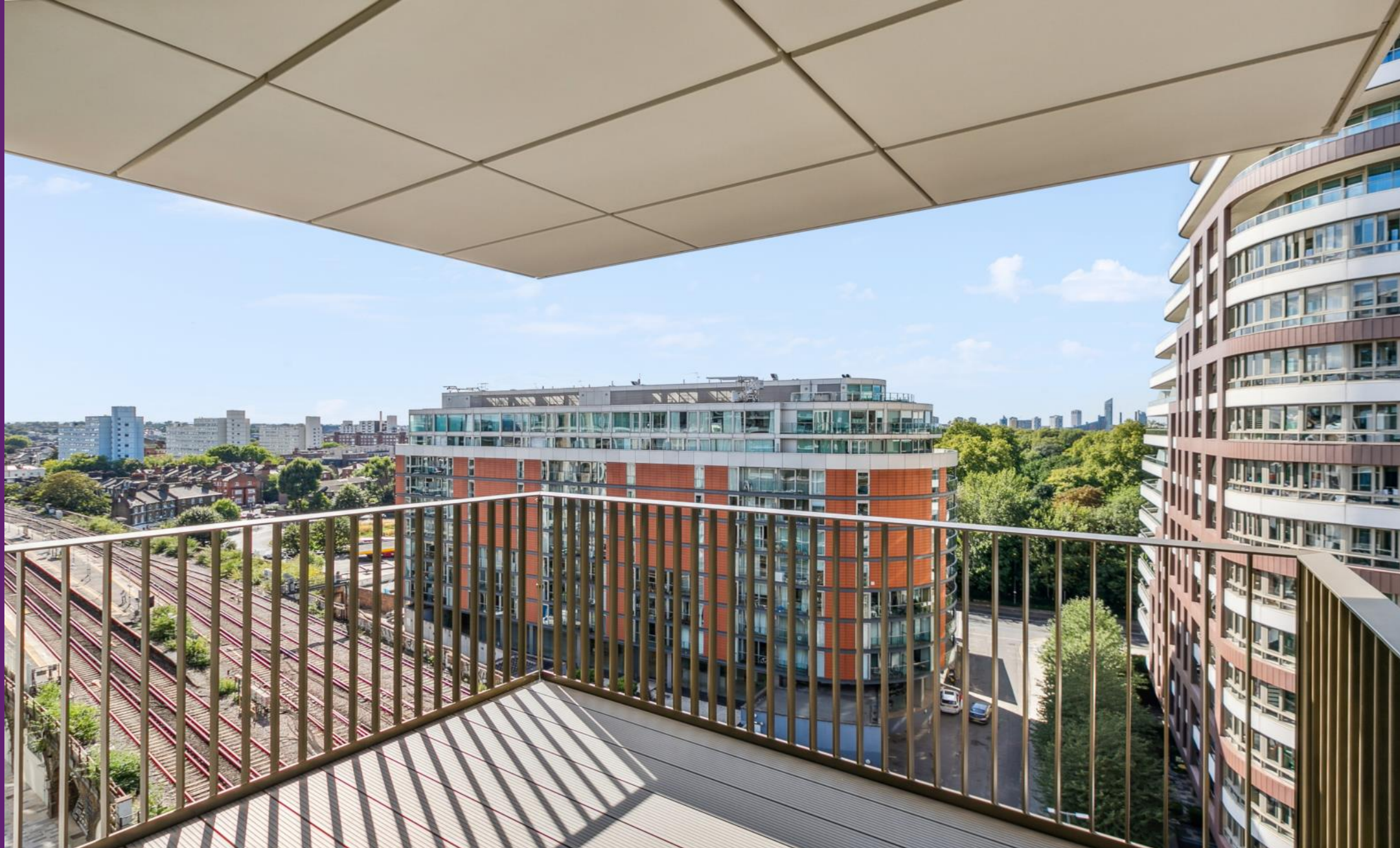
Darwin House 8 Palmer Road, SW11