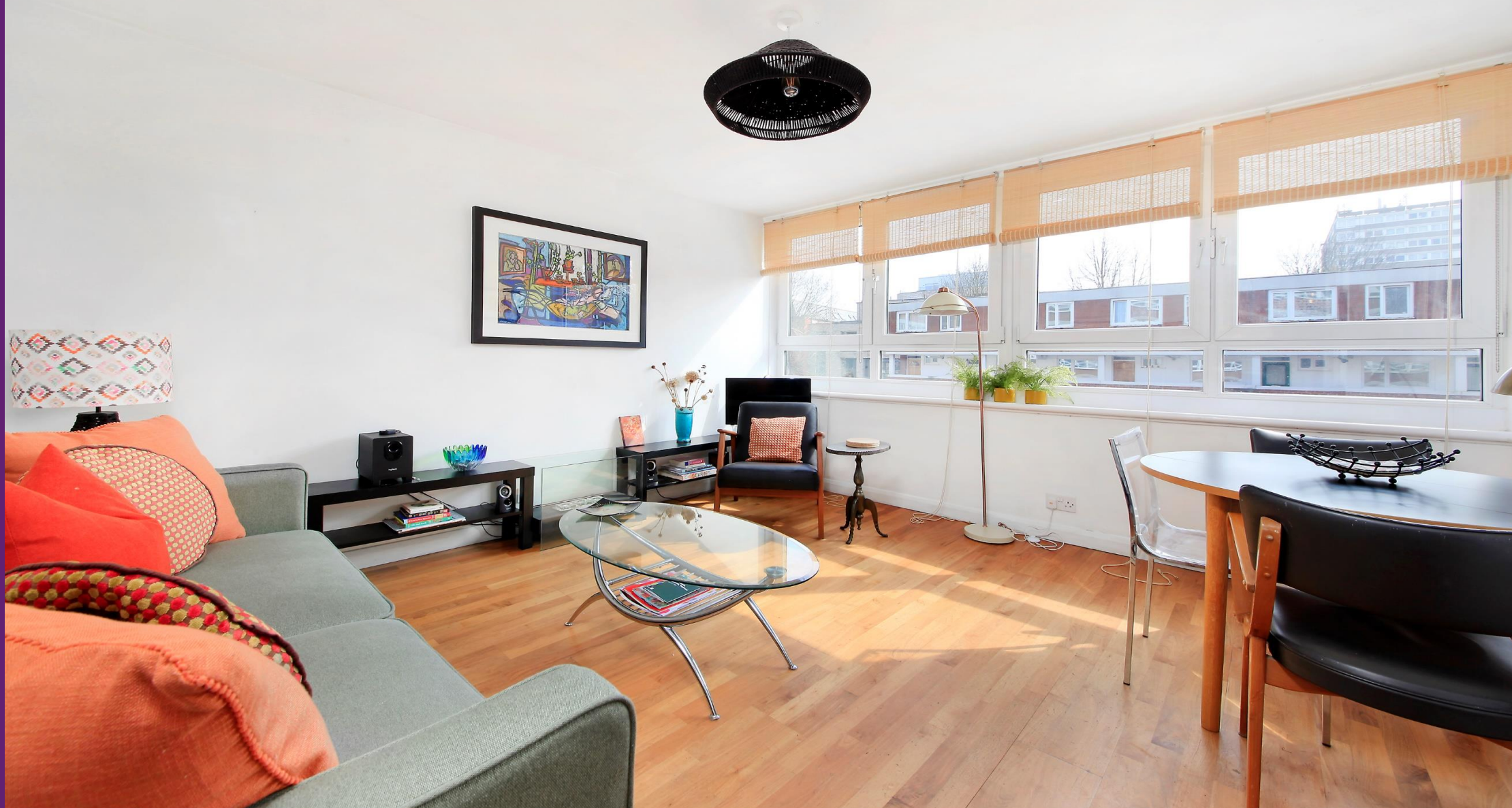
Musgrave Court 110 Battersea Bridge Road, SW11