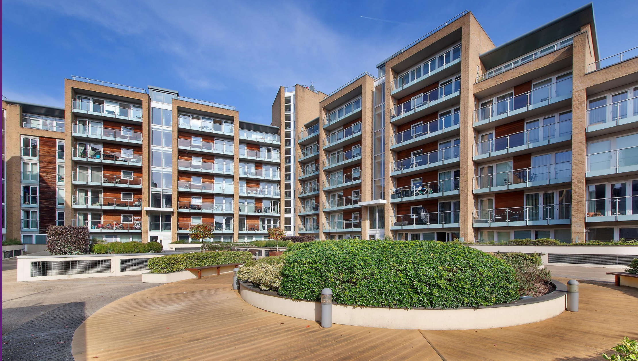
Viridian Apartments 75 Battersea Park Road, SW8