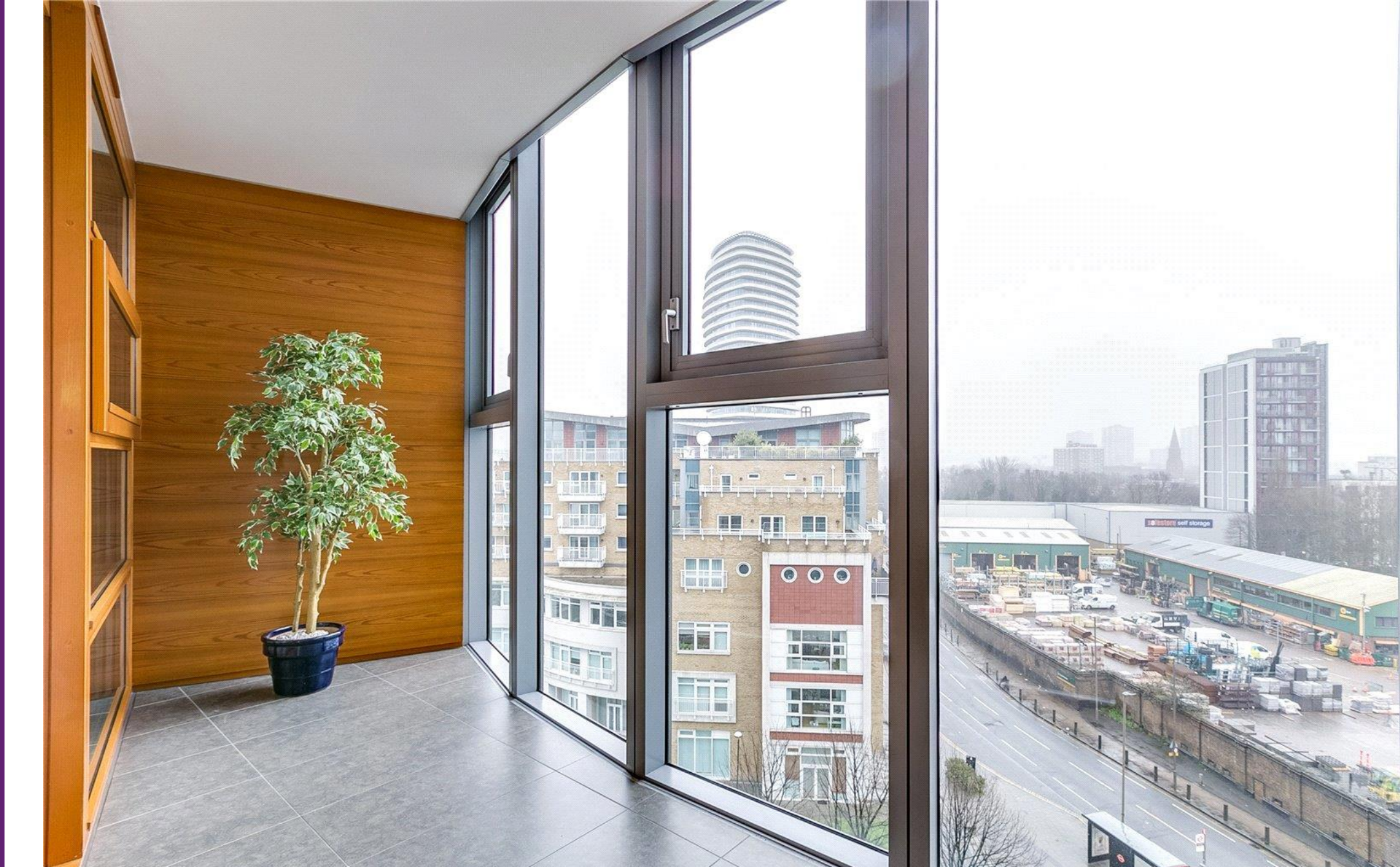
Falcon Wharf 34 Lombard Road, SW11