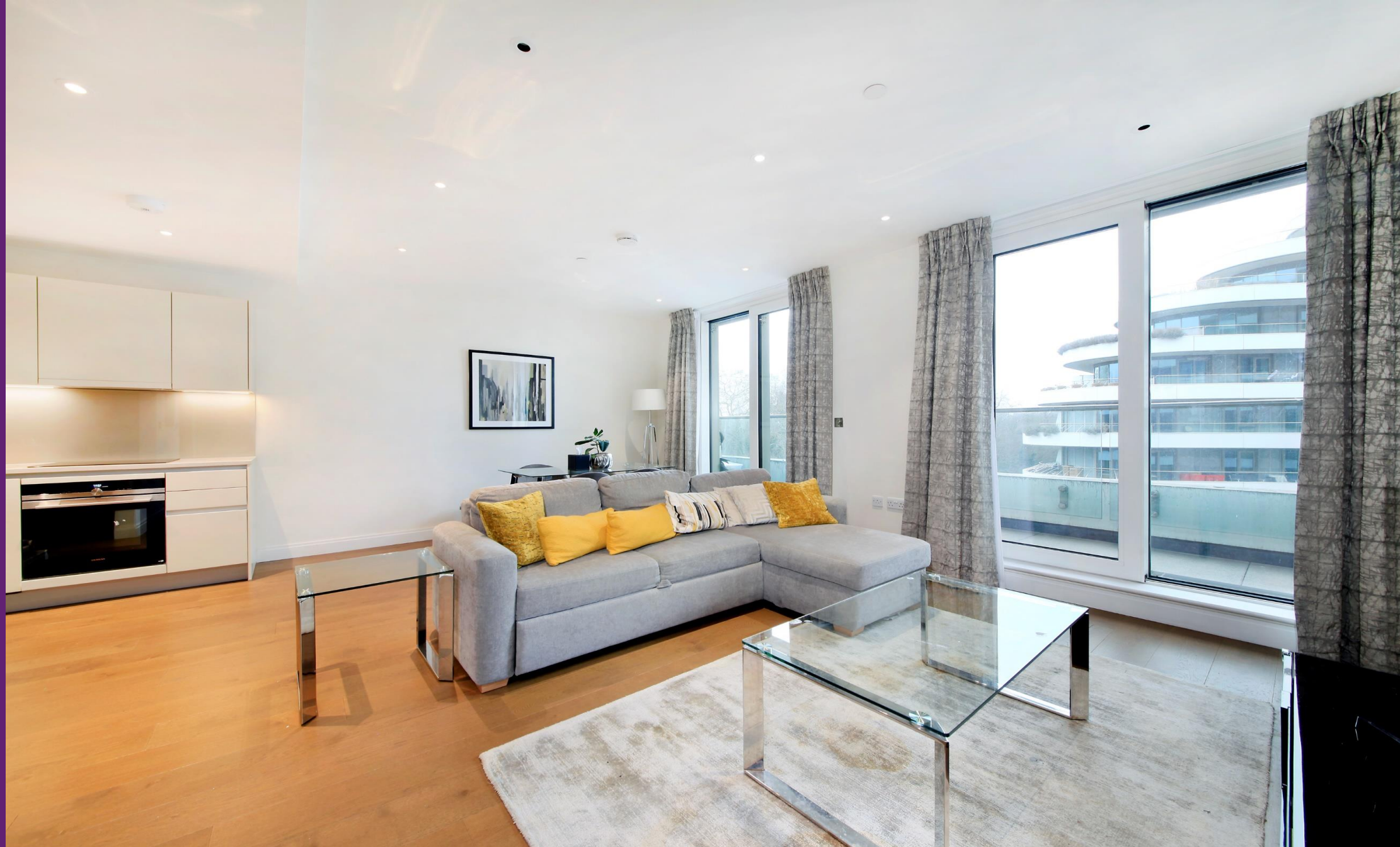
Valetta House 336 Queenstown Road, SW11