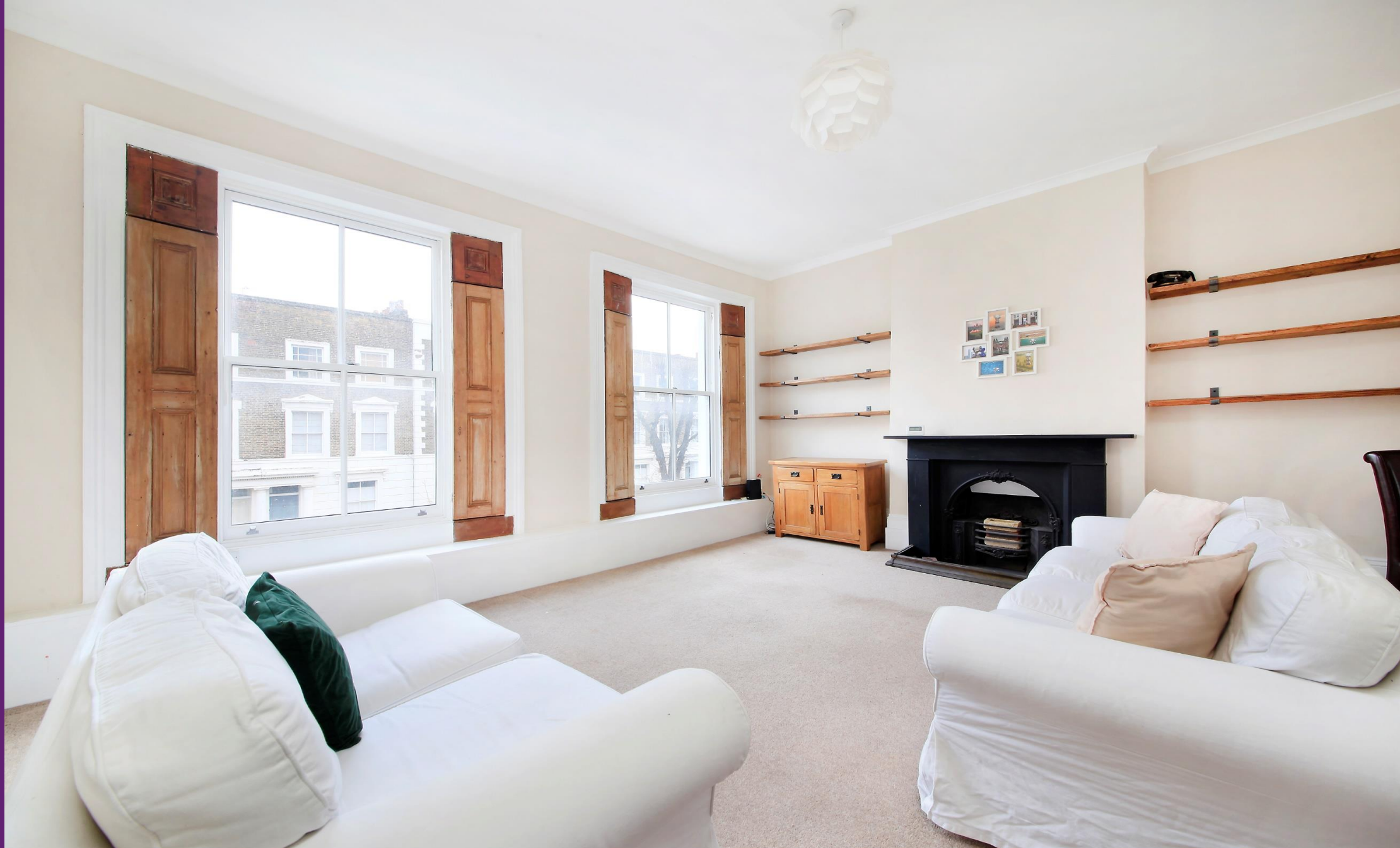
Richborne Terrace London, SW8