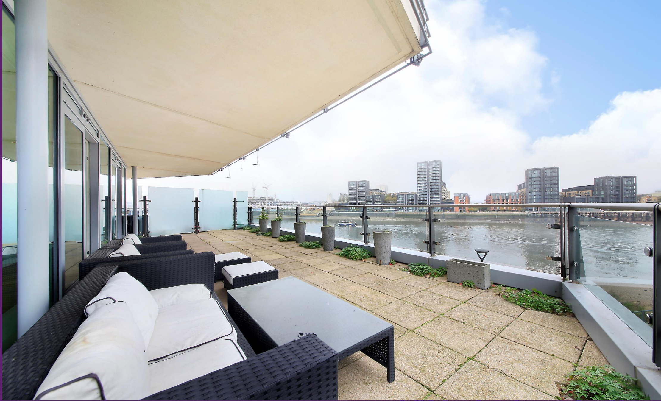
Ensign House Battersea Reach, SW18