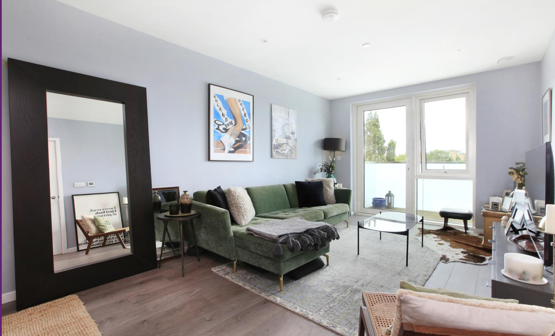
Discovery House Juniper Drive, SW18