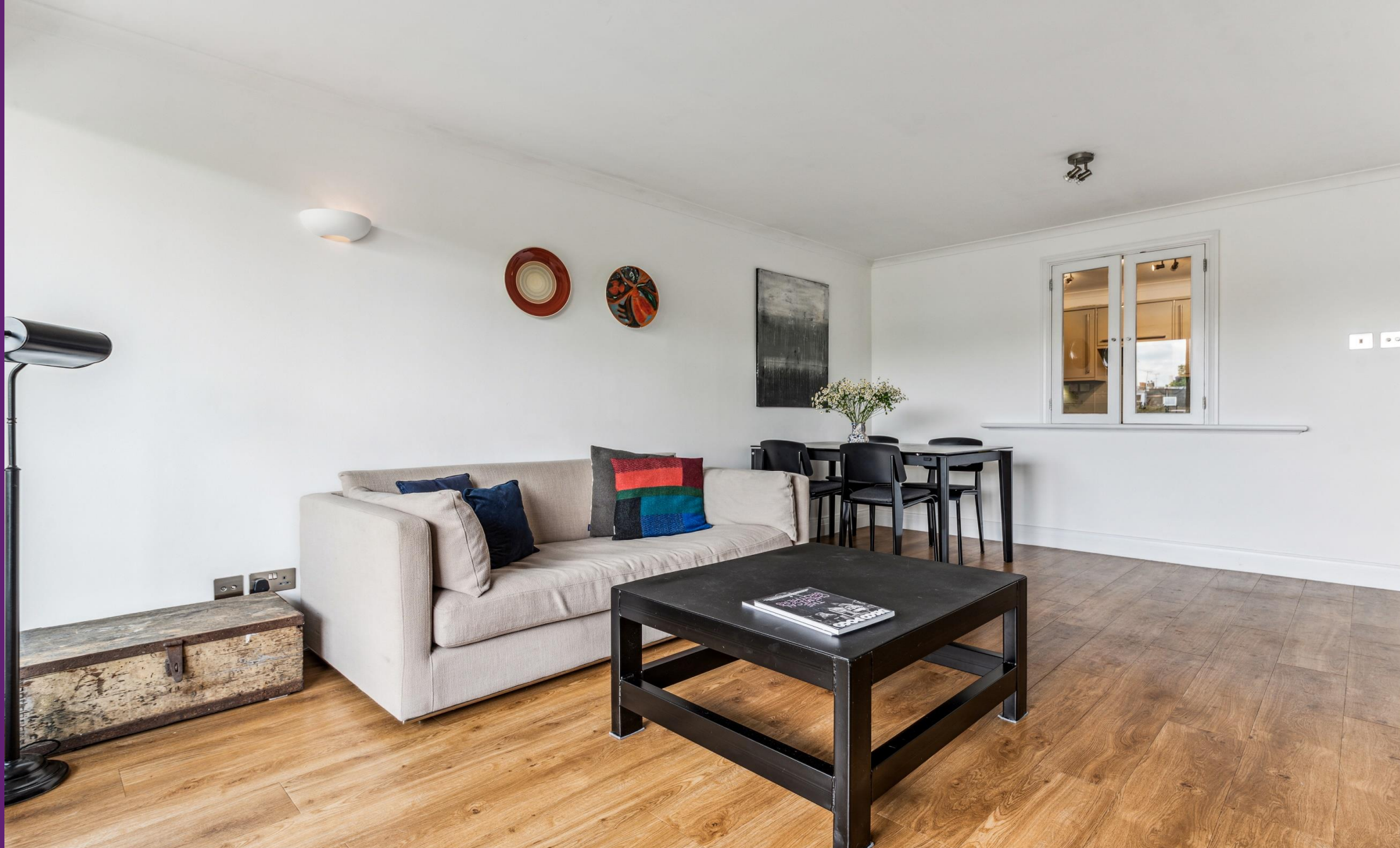
Bishops Wharf House 51 Parkgate Road, SW11