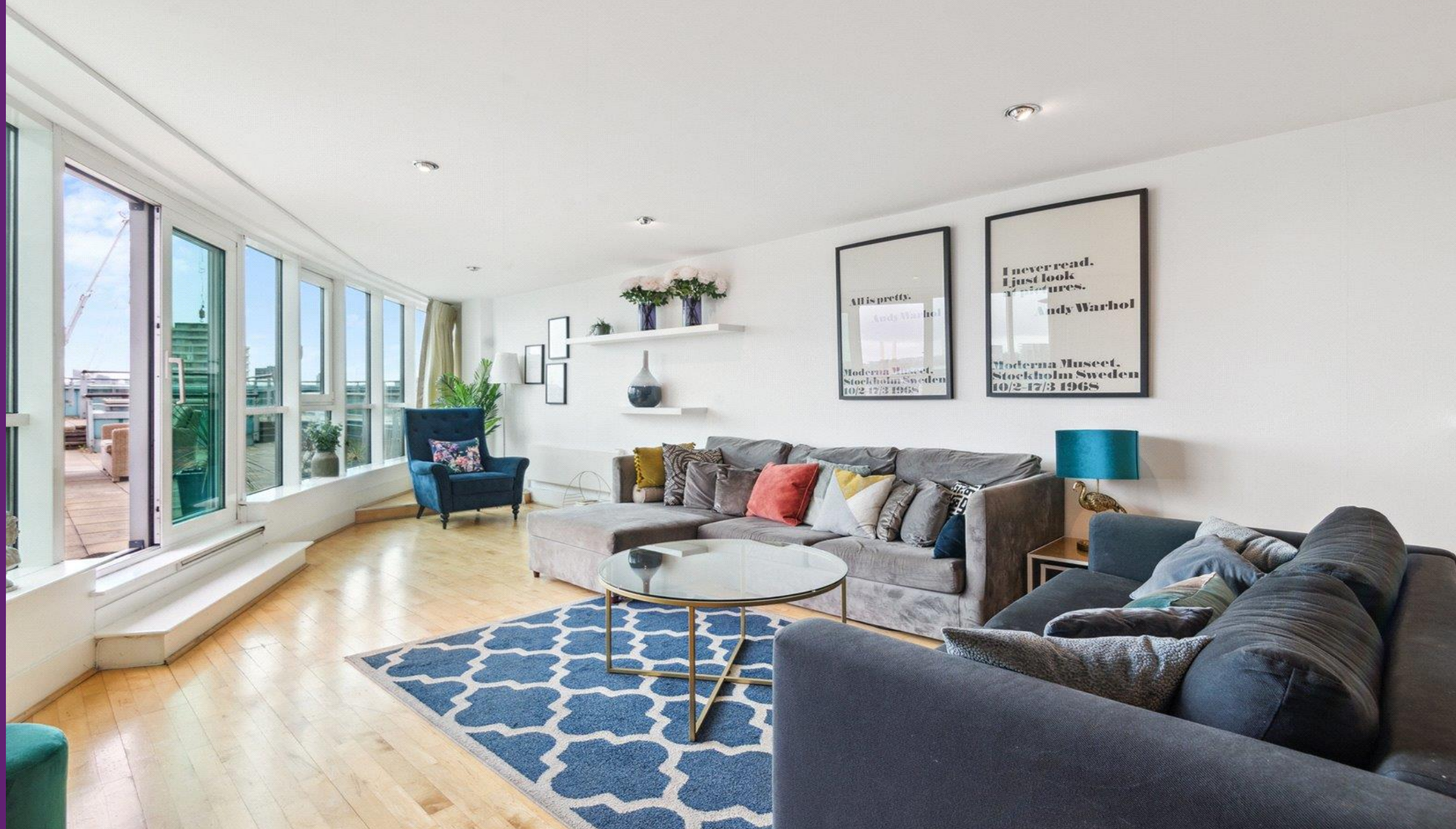
Bridge House 18 St. George Wharf, SW8