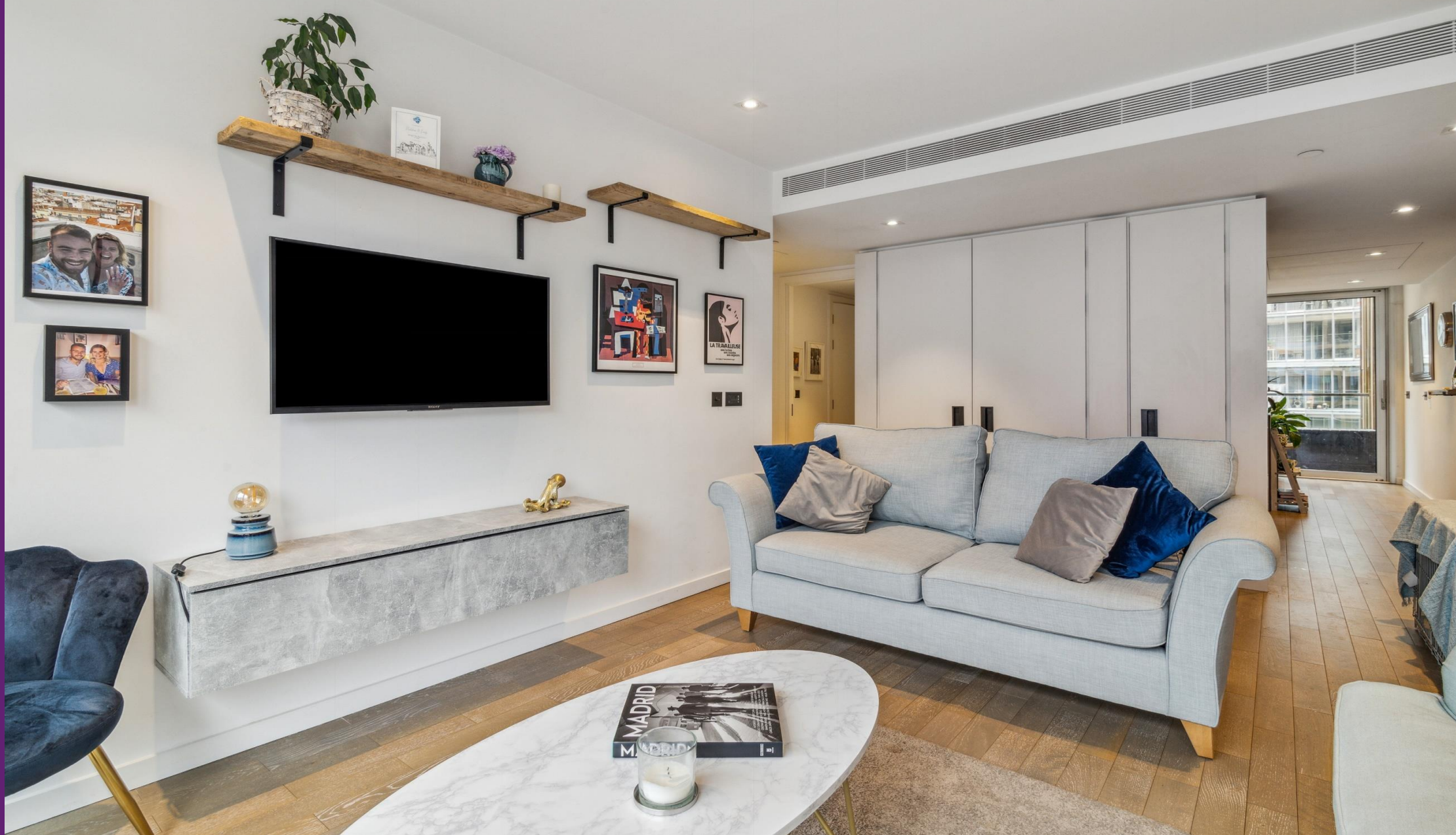
Faraday House Aurora Gardens, SW11