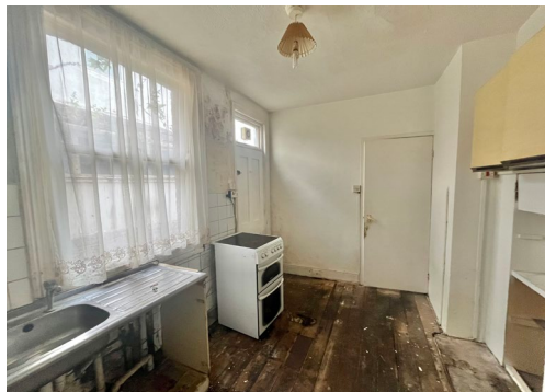
Fisher Street | Paignton | TQ4 5ER

A one bedroom ground floor flat, just off the town centre with level access to shops and short distance of seafront. The property requires modernisation throughout and will ideally suite a developer or investors. Nor forward chain.