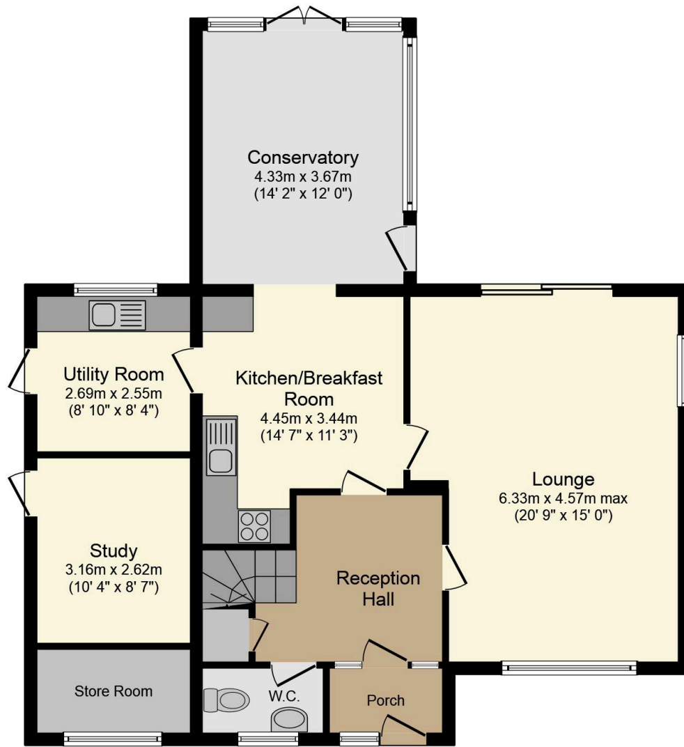
Ground Floor Floor area 92.0 sq. m. (990 sq. ft.) approx