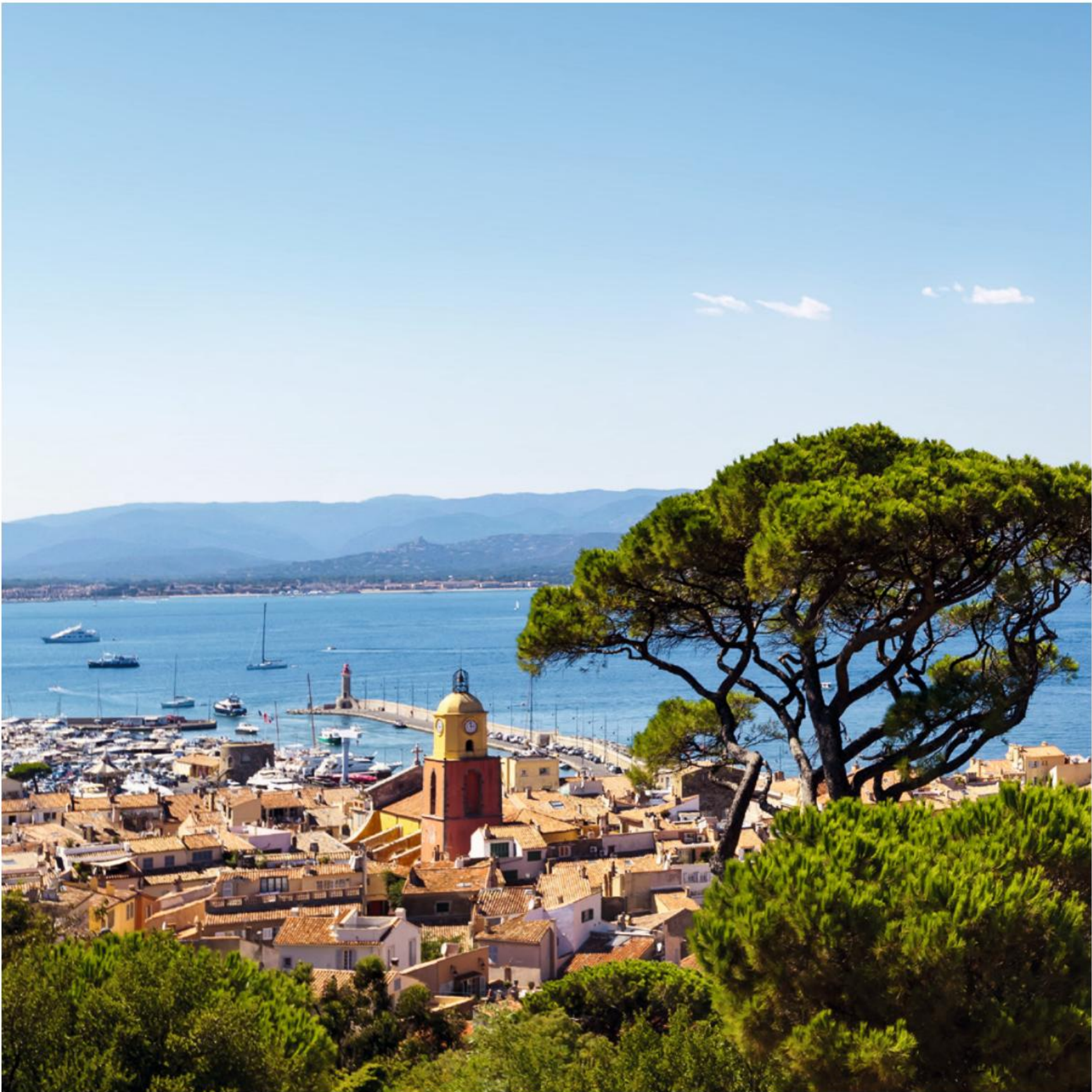
Saint-Tropez and Grimaud, two villages facing each other on the gulf

A corsair city that became a fishing village, an artistic melting pot and a world village. Like its muse Brigitte Bardot, Saint-Tropez combines sumptuous festivals and passion for exceptional nature.