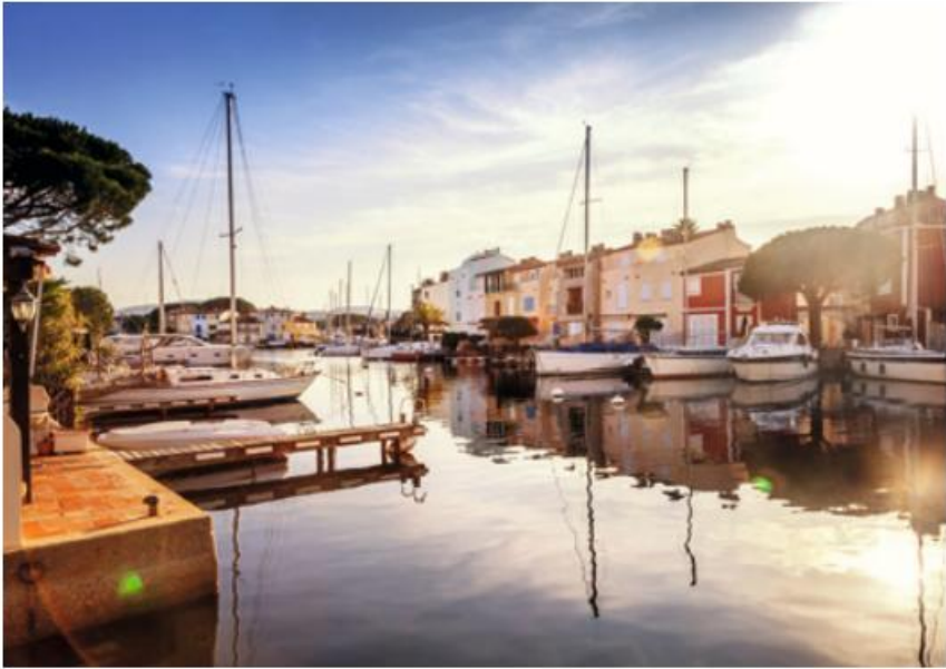
Port-Grimaud, the little Provençal Venice

The colors of Provence, the romanticism of a lakeside city... Port-Grimaud magically embodies the voluptuousness of the Gulf of Saint-Tropez. Designed by architect François Spoerry in the 1960s, the city offers a unique panorama in the world, sometimes evoking Murano and sometimes New Orleans. A sailor's paradise, Grimaud offers a rich seaside life, with its iconic beaches and numerous activities. When the day is over, all that remains is to jump on board one of the water boats to reach a restaurant on the edge of the lagoon or go stroll along the stalls of its emblematic summer night market.