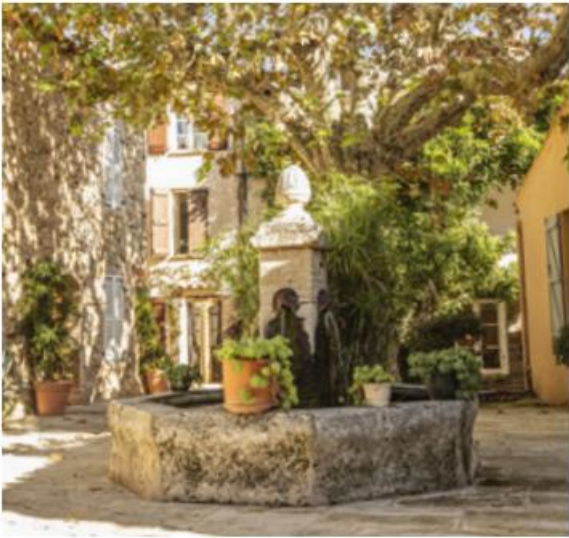
The authentic heart of Grimaud 200 m*