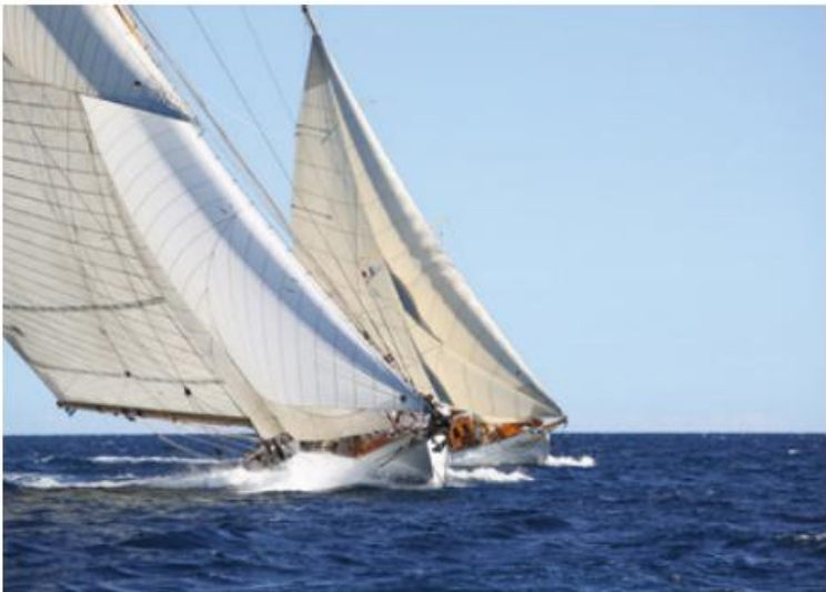
“Les Voiles de Saint-Tropez”, the international yachting event

If the peninsula concentrates the major international meetings, the most prominent palaces, the legendary terraces, like that of the Sénéquier, plunging into the heart of the Gulf the atmosphere becomes more discreet, the luxury becomes hushed, the beaches wilder. It is on this intimate slope of the most famous Gulf of France that Grimaud-l'authentique cultivates its refinement.