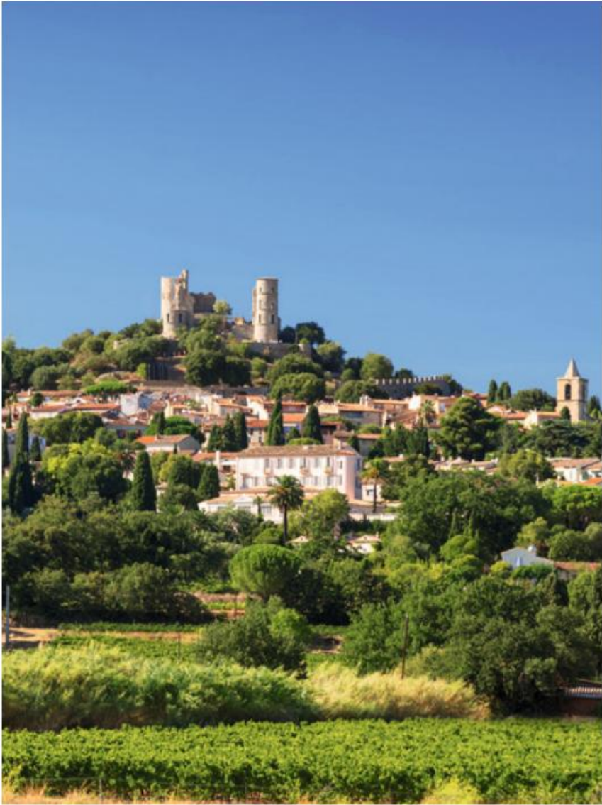
Medieval sentinel, the Château de Grimaud facing the sea