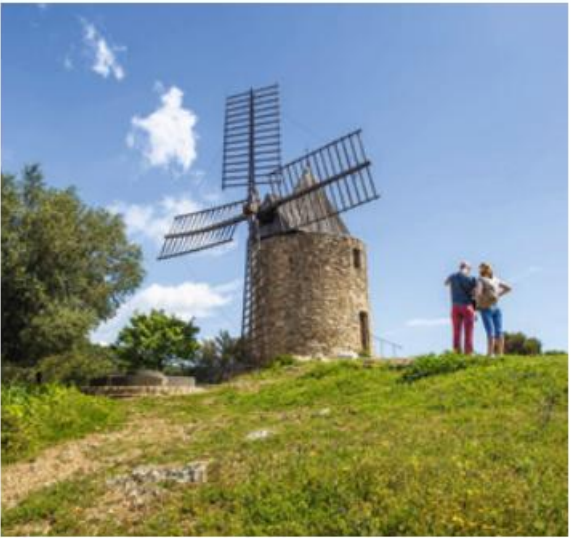
The St-Roch mill at 600 m*