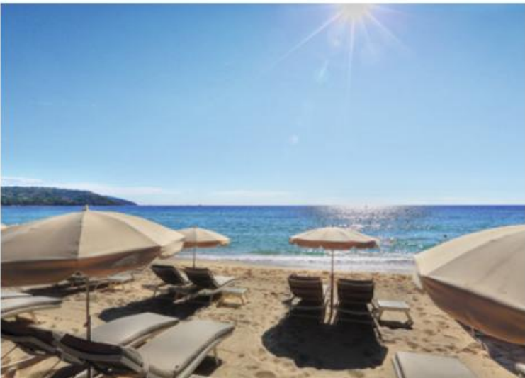
The Gulf of Saint-Tropez and its famous fine sandy beaches...