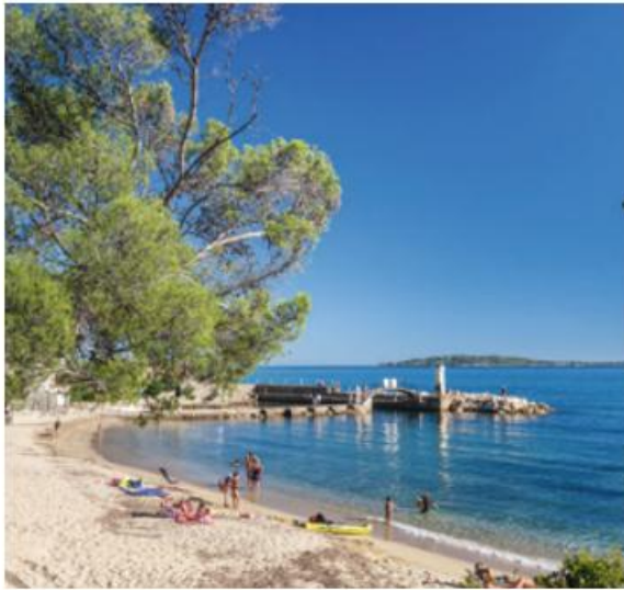
Coves and fine sandy beaches 10 min* by car