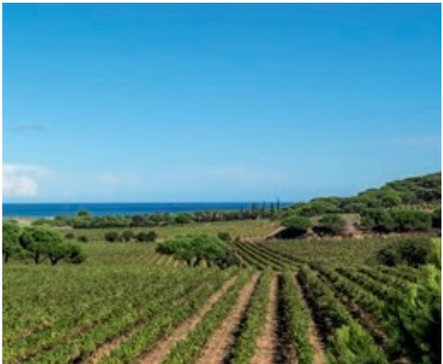
The vineyards and beach of Pampelonne 15 km away*.