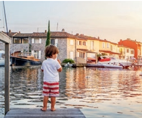
Port-Grimaud, the little Venice of Provence