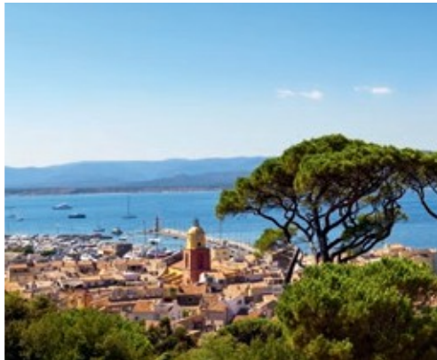
The myth of Saint-Tropez 11 km away*