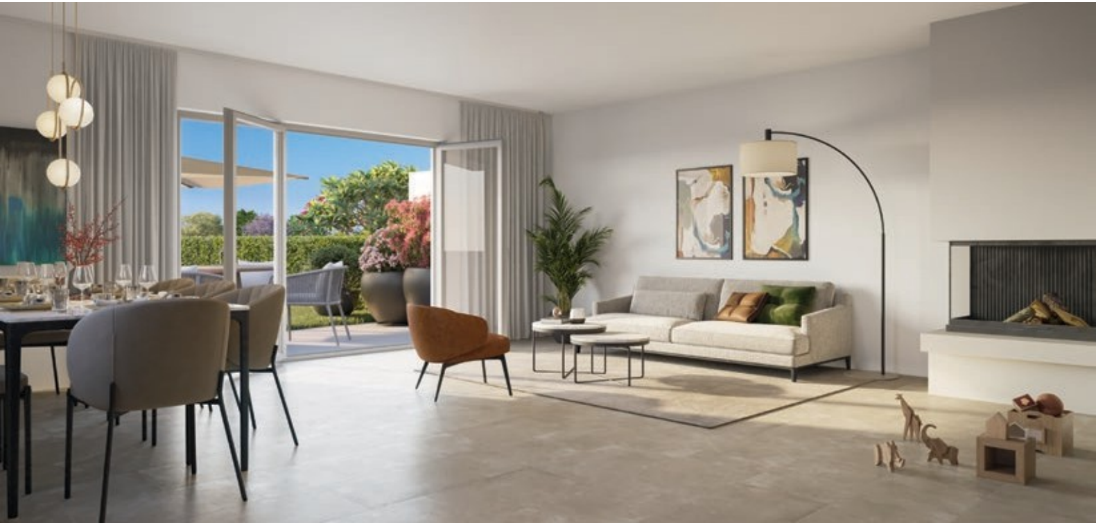
Non-contractual, atmospheric illustration of a Cogedim development.