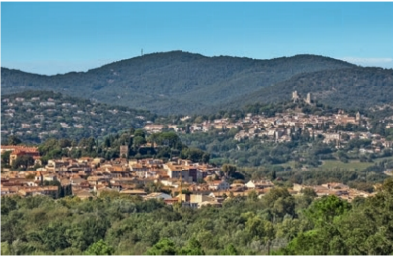
Cogolin and Grimaud, the authentic, natural side of the Gulf

In the heart of Cogolin, a stone's throw from all the essentials, it's here that Les Hauts du Golfe has inherited an address that's seductive on many levels. An idyllic refuge between sea and nature, it invites you to see everyday life in a new light, where almost everything can be done on foot or by bike, accompanied by the song of the cicadas.