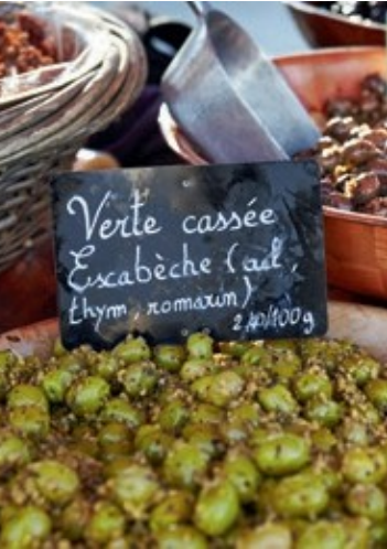
Cogolin's Provencal markets, Wednesday and Saturday mornings