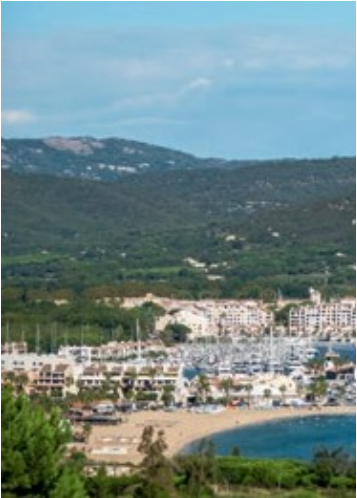
Les Marines de Cogolin and the beach 7 km away*