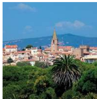
Over 2,000 years of history