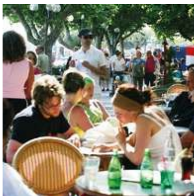
The art of Mediterranean terrace living