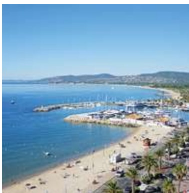
A remarkable 8 km* coastline of fine sandy beaches and calanques