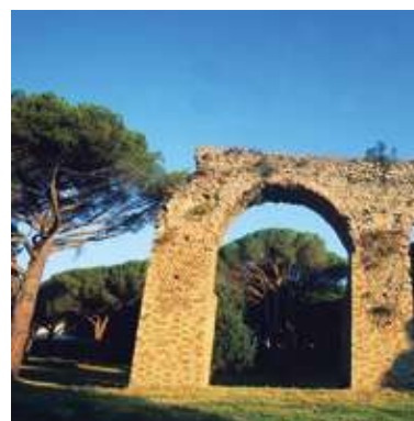
Remains of a Roman aqueduct in the heart of the city of the 24-hectare* Parc de la Villa Aurélienne