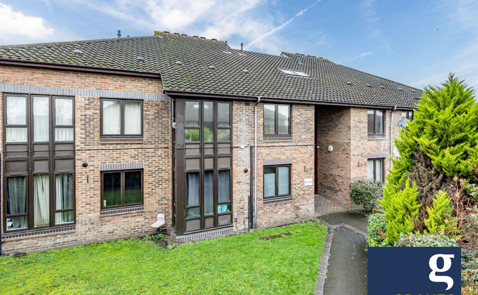
Gate Court, Weybridge, KT13 8NW