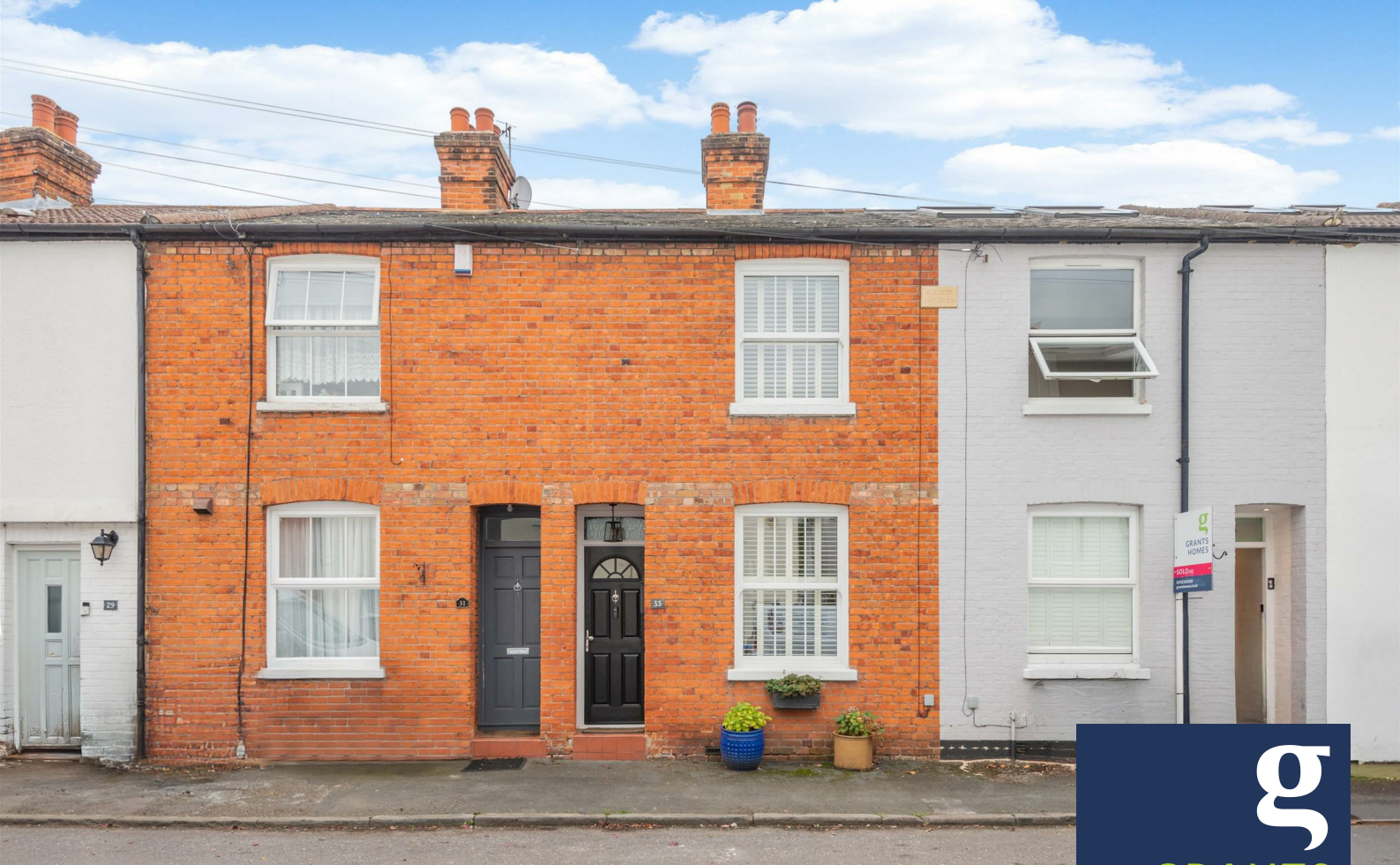
Glencoe Road, Weybridge, KT13 8JY